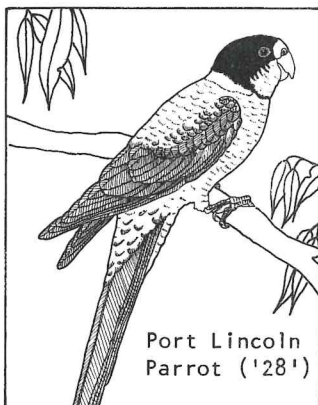
Port Lincoln Parrot ('28')

One of the most interesting features of the Red-capped Parrot is its long, pointed bill. Many naturalists contend that the shape of the bill is an adaptation to allow Red-capped Parrots to feed with maximum efficiency on the seeds of marri ( Eucalyptus calophylla ).