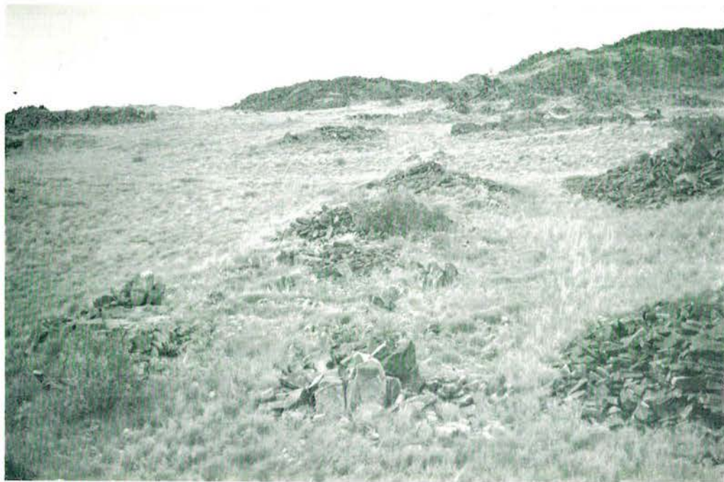
PLATE 1 Angel Island.