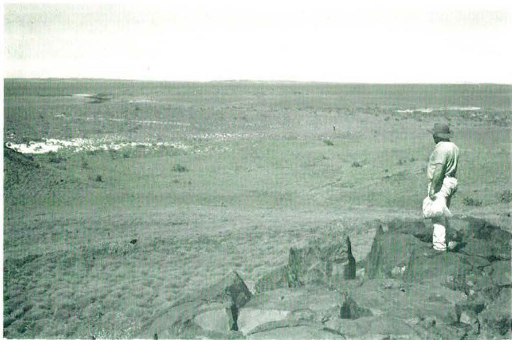
PLATE 2 Enderby Island looking toward the mainland.