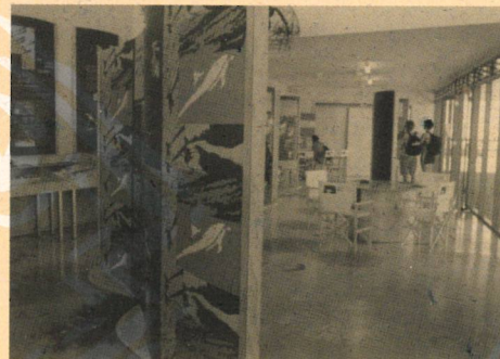
The interior of the Monkey Mia Visitors' Centre.