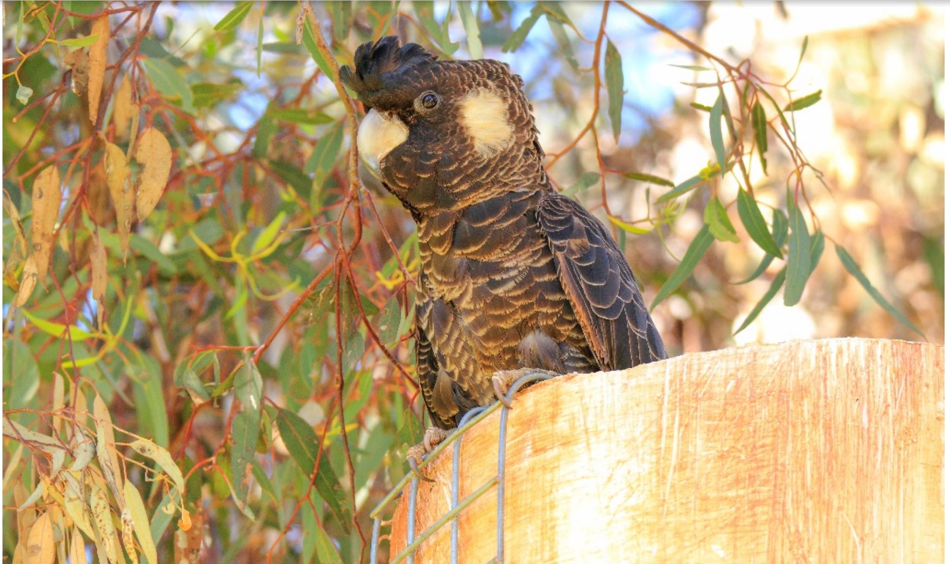
WA's Threatened Species – the Carnaby's Black Cockatoo is making a comeback thanks to artificial nesting