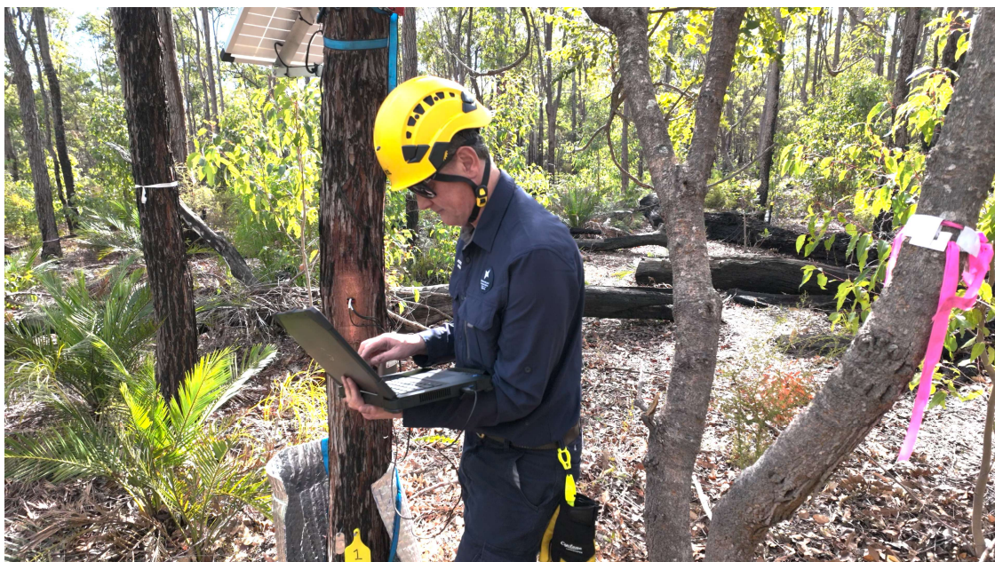
Above: The FHMP team use a wide range of equipment to monitor.