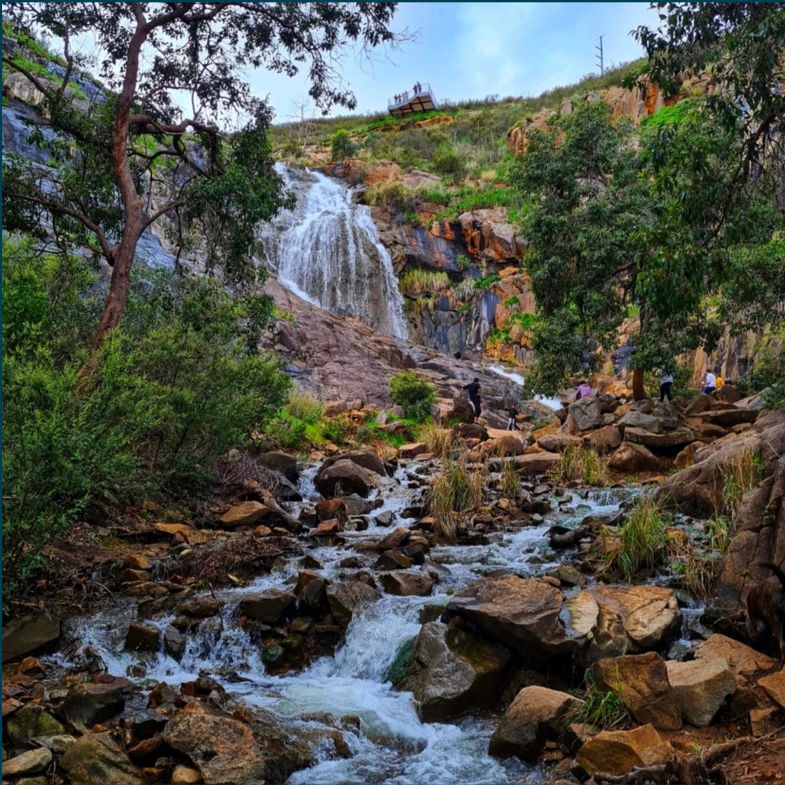
📷 Lesmurdie Falls via @sinzer737 Instagram