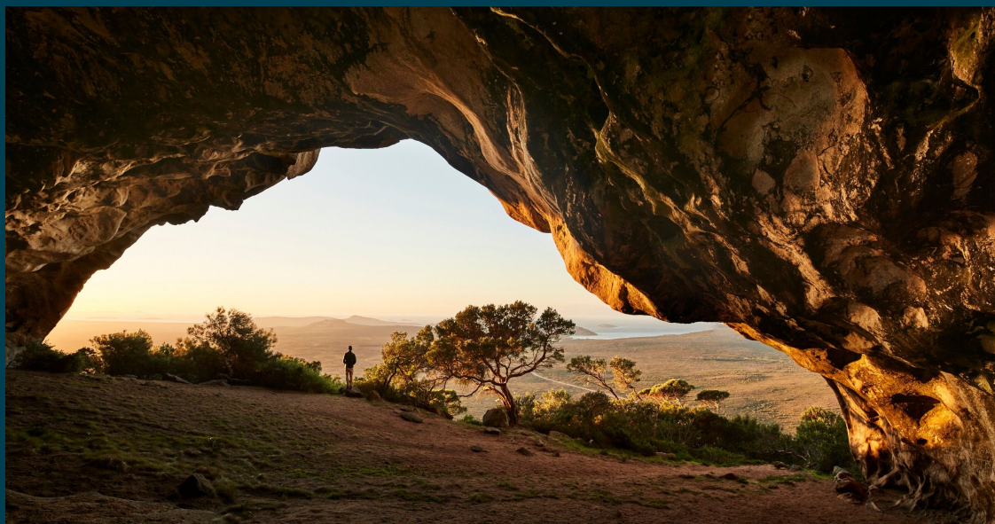
Frenchman Peak, Cape Le Grand National Park