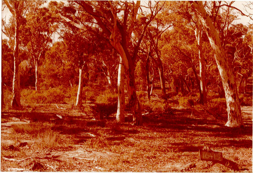
Plate 1. Reserve 16412 showing Wandoo woodland with understorey of Gastrolobium and Hypocalymma .