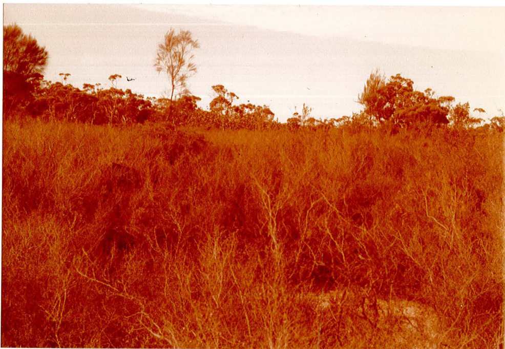
Plate 2. Leptospermum erubescens heath. Note clump of Eucalyptus macrocarpa in the distance.