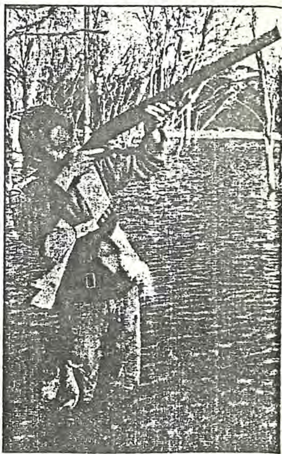
Attempting a shot at a fast moving bird.

like a spluttering fighter plane, one bird faltered and began a slow glide to the dark water further out.