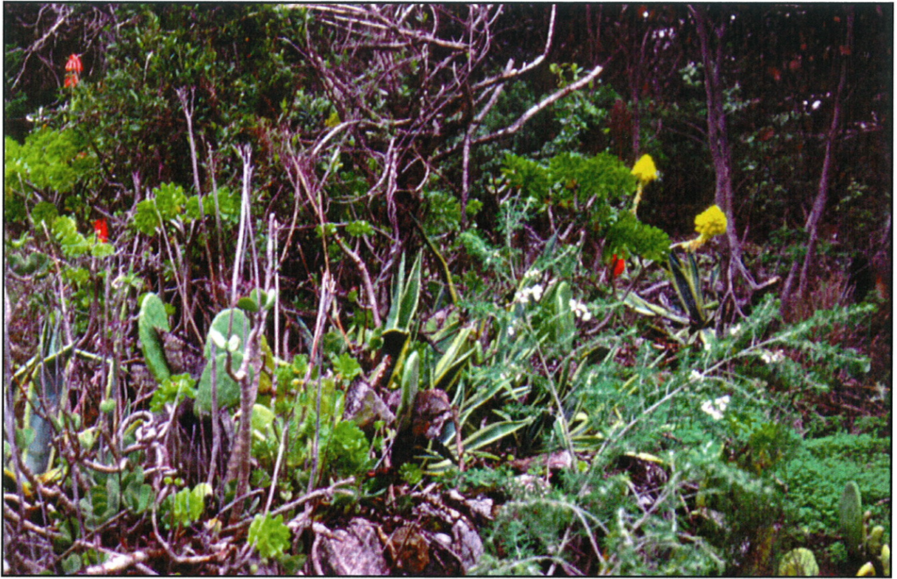
An abandoned ?shepherd's hut near Cape Riche. Note: Diverse assemblage of weeds and garden escapes, including scrambling Aloe ciliaris (red) and Aeonium arboreum (yellow).