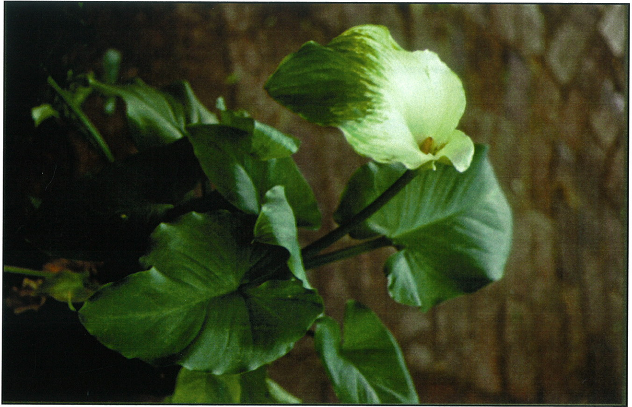
Zantedeschia aethiopica CV Green Goddess, a garden escape of a variant of a common weed.