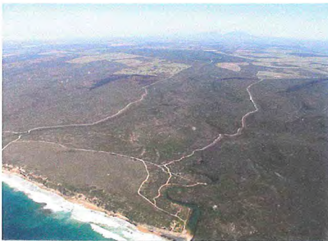
Image 3: A view northwards from Swan. The photo gives an impression of the difficulty to access this coastal terrain.