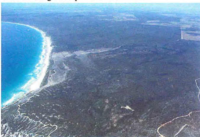
Image 6: The July 2001 burn reignited from smouldering litter from under an old firebreak bulldozer pile. The fire burnt slowly eastward along cliff tops above Jack's Beach.