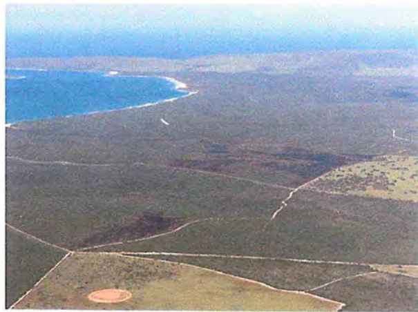
Image 2: Further eastward in the reserve. Two burns done in July 2000 from the northern boundary of the reserve.