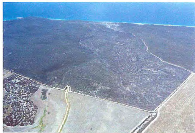
Image 5: Burn done in July 2001 from northern boundary of reserve down to Jacks Beach. Maximum width of burn approx. 800 metres.