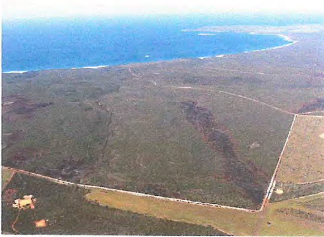
Image 4: Burns done in July 2000 & 2001 from the northern boundary of Cheyne Bay Reserve