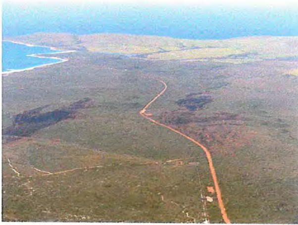
Image 1: Mosaic burns done in July 2000 with a 15 knot NNE wind. (Sandalwood Rd . leading down to Cape Riche).