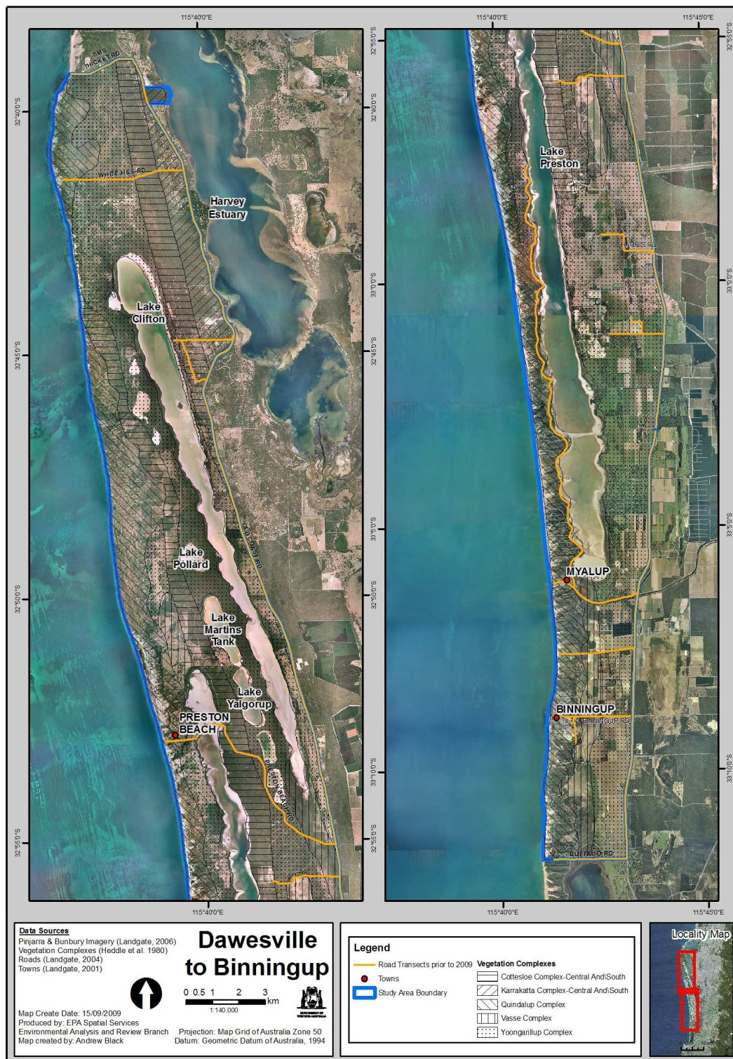
Figure 3: Map showing road transects between 2003 – 2008 bird survey.