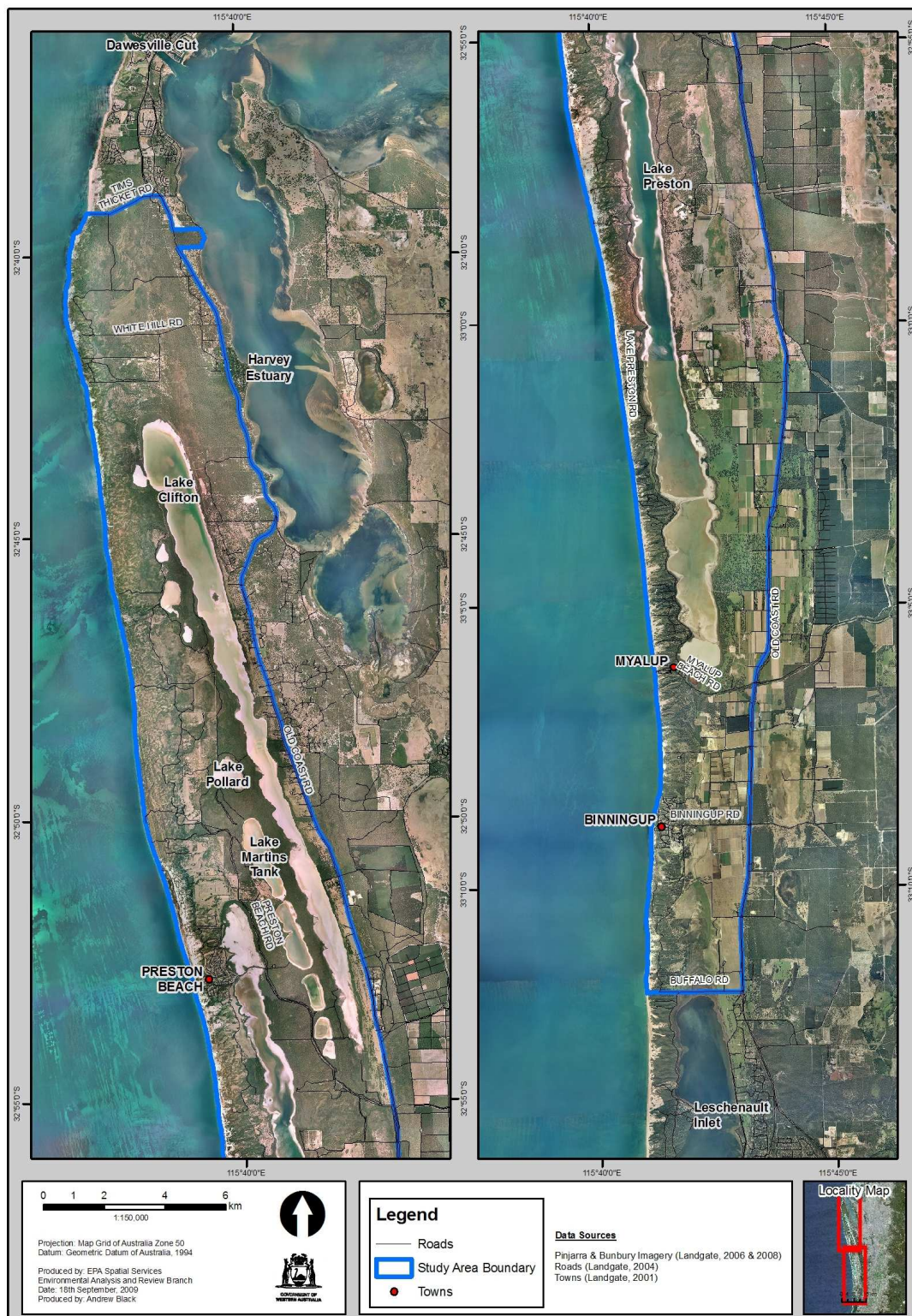
Figure 1: Map showing the Dawesville to Binningup study area.