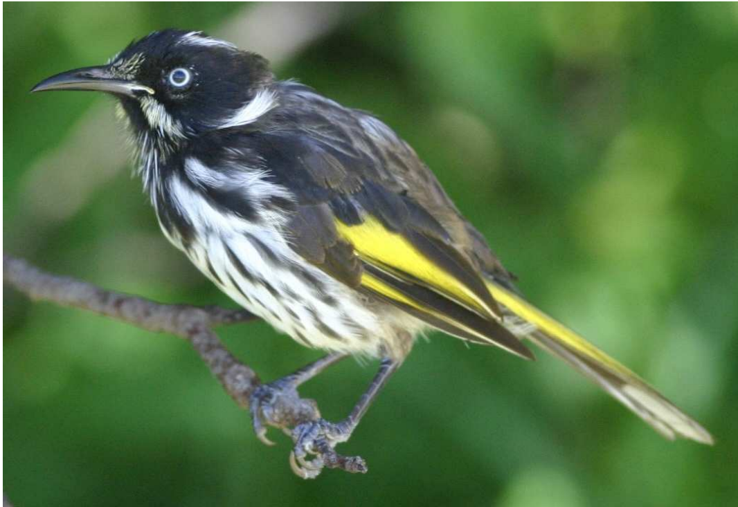
New Holland Honeyeater