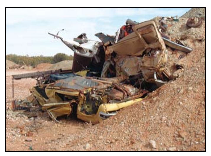
Resting/nesting area (arid tip site), Elizabeth Denny