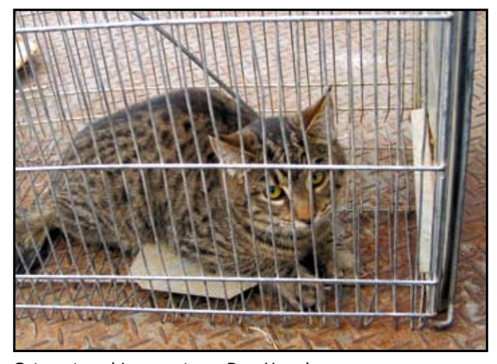
Cat captured in cage trap, Dan Hough