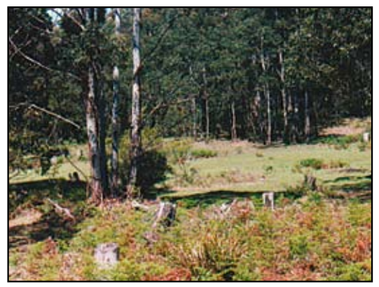
Poor tracking/scat collection habitat (forest), Elizabeth Denny