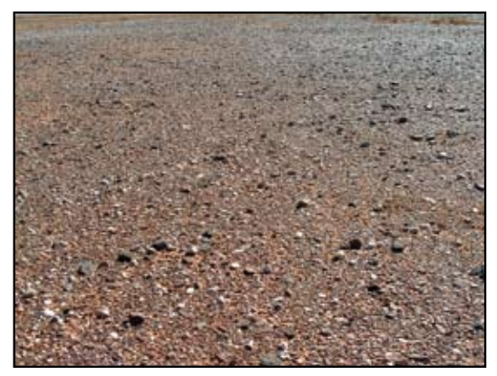
Poor tracking/scat collection habitat (arid zone), Elizabeth Denny