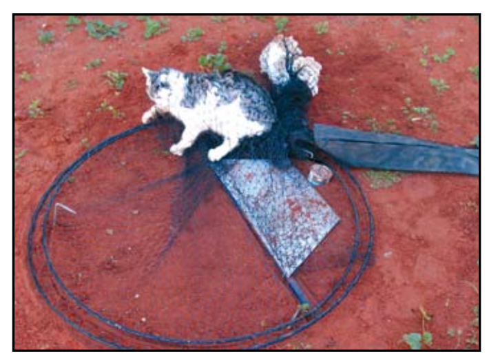
Cat captured in net trap, Dan Hough