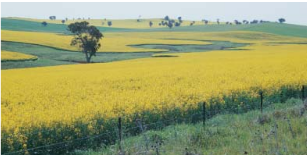
Canola crop with a single tree left marking the riparian zone — in this situation a riparian filter strip could be used to protect the ephemeral stream from any soil lost during crop establishment.

By its very nature, riparian land is fragile, and performs a vital link between land and water ecosystems. Its productivity also makes it vulnerable to over-use and to practices that cause it to deteriorate, creating additional problems. Good management of riparian land is not a substitute for good land management practices elsewhere in a catchment. However, it is an essential component of sustainable management of a property or landscape that can yield numerous benefits.