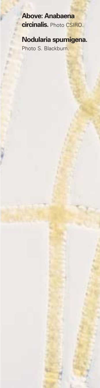
Nodularia spumigena.