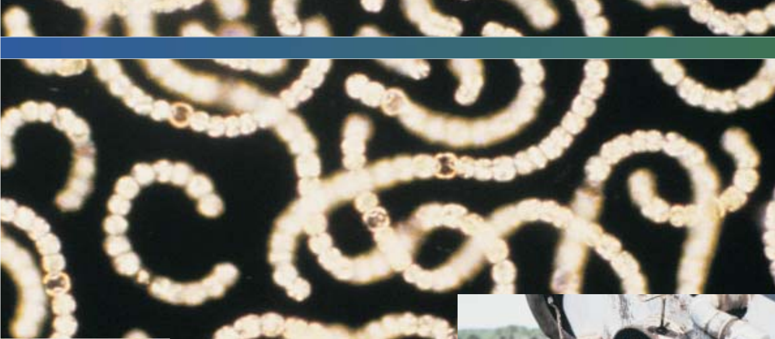
Above: Anabaena circinalis.