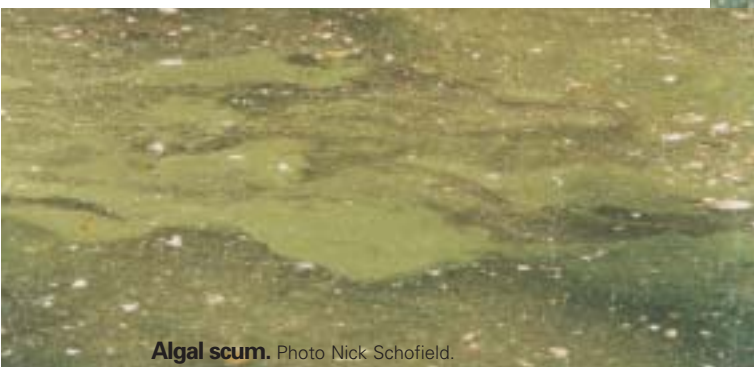
Algal scum.

Models can now be used to assess whether a river section is likely to be stratified or mixed under different flow and weather conditions. These models have been applied to the Murray and Murrumbidgee rivers of south-eastern Australia, and have recently been extended to coastal Queensland rivers such as the Fitzroy River. One of the main outcomes of the projects on the Murrumbidgee and Murray Rivers was the development of a 'mixing criterion' for turbid rivers. This criterion is a numerical value that can determine the time for the on-set of stratified or mixed conditions. It is based on estimates of river depth, flow, solar radiation, depth of light penetration and wind speed. Whether a river is stratified or not is determined by the relative balance between solar radiation (which has a tendency to stratify the system) and wind, evaporation and flow (which have a tendency to mix the system).