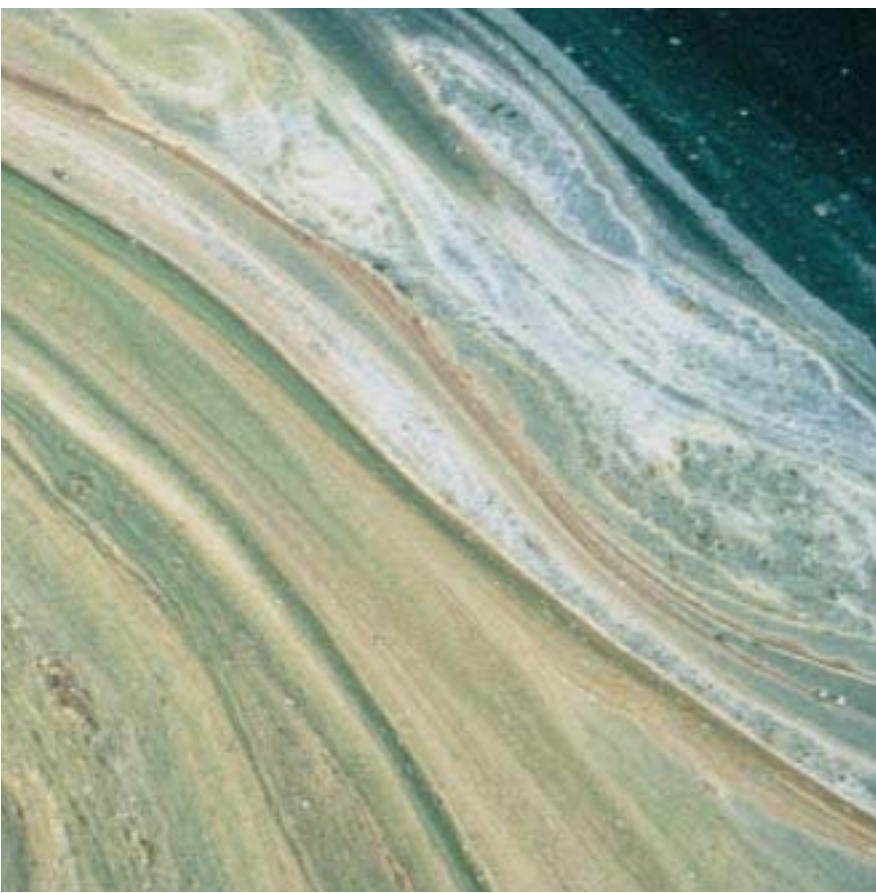
Algal scum.

The recent application of this model in the weir pools of the Fitzroy River Basin confirms that the management of flows has very important implications for the control of blue-green algal blooms. In the Dawson River, a tributary of the Fitzroy, managed flow releases increased the turbidity of the river for sufficiently long periods to decrease the light available for blue-green algal growth, even when the flow releases contained high nutrients. It was found that daily flows greater than the capacity of the weir pool were required to ensure mixing of the entire water column, thereby removing the stratified conditions required for blue-green algal growth. In contrast, ad hoc flow releases had a short term impact (days) on light conditions and algal growth, as it failed to mix the entire water column.