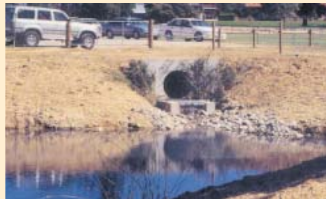
A stormwater pipeline.

High stormwater discharges from urban areas increase the amount of organic material deposited in the reservoir inlet. Various stormwater management techniques such as infiltration and buffer zones can be used to reduce this problem.