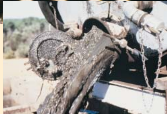
It is important to manage waste disposal so that it does not enter reservoirs, or is dispersed as widely as possible.

In reservoirs, it is important to limit the organic material discharge (direct and indirect) from catchments into reservoirs. Priority should be given to reducing wastewater effluents, organic fertilisers, grass clippings and leaves from deciduous trees that promote blue-green algal growth. Managers should also ensure that when well-nitrified wastewater effluent or drainage is discharged it is low in ammonia and organic material.