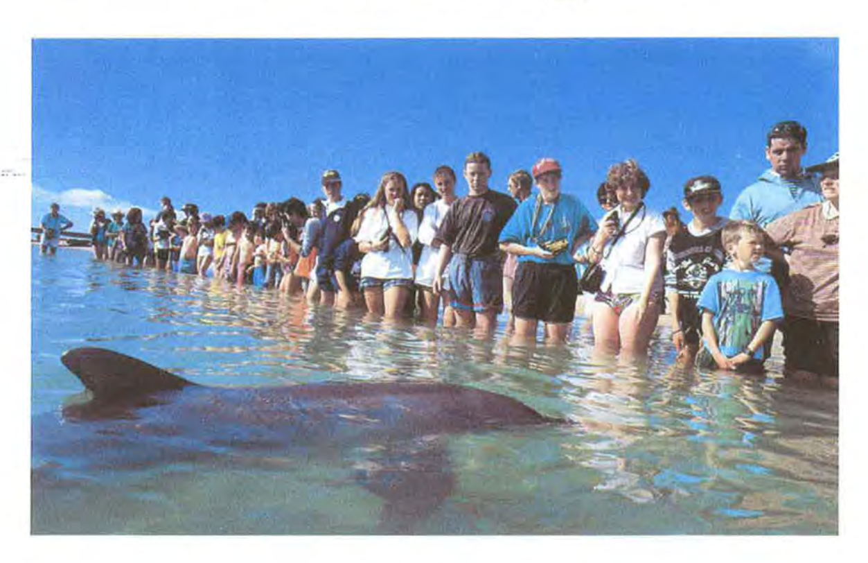
Number of Provisioned Dolphins at Monkey Mia