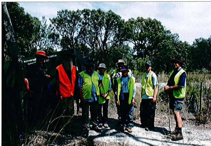
Photo: Survey volunteers at Banksia Nature Reserve for Caladenia huegelii .