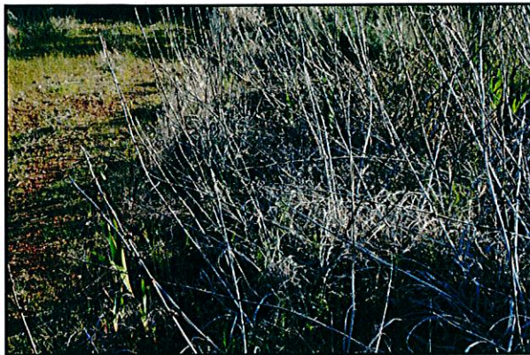
Photo: Death of Watsonia post weed spraying at Fletcher Park for DRF and TEC conservation.