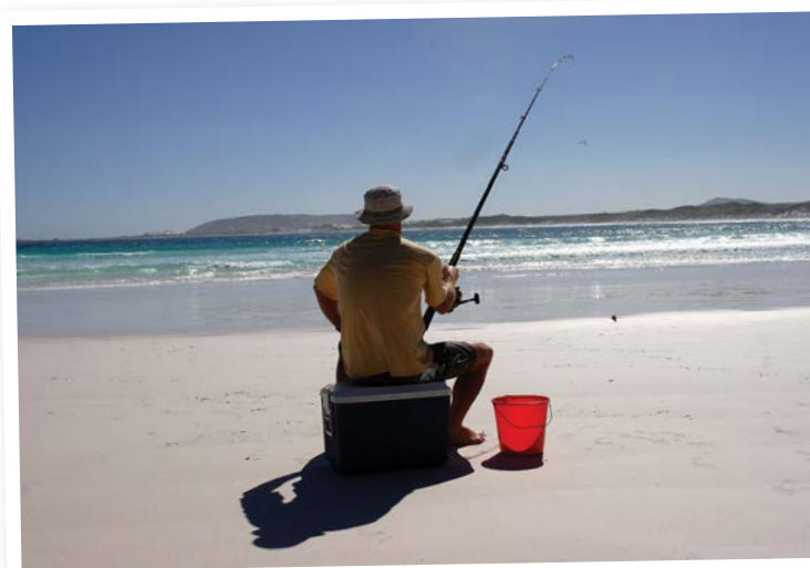
Above Fishing off Wharton Beach.

The marine environment of Western Australia’s south coast is unique and includes outstanding natural values. The region supports diverse marine habitats, plants and animals, and is home to the Great Southern Reef – a system of temperate reefs dominated by kelp forests spanning more than 8000km from Kalbarri in Western Australia’s Midwest, across Australia’s southern coastline, and north as far as the subtropical waters of northern New South Wales. Australia’s south-west marine environment is a global biodiversity hotspot, and the natural and cultural values found here provide a range of social and economic benefits, including generating employment and revenue for the region.