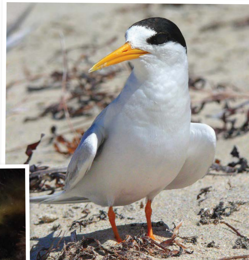
Previous page Golden kelp.