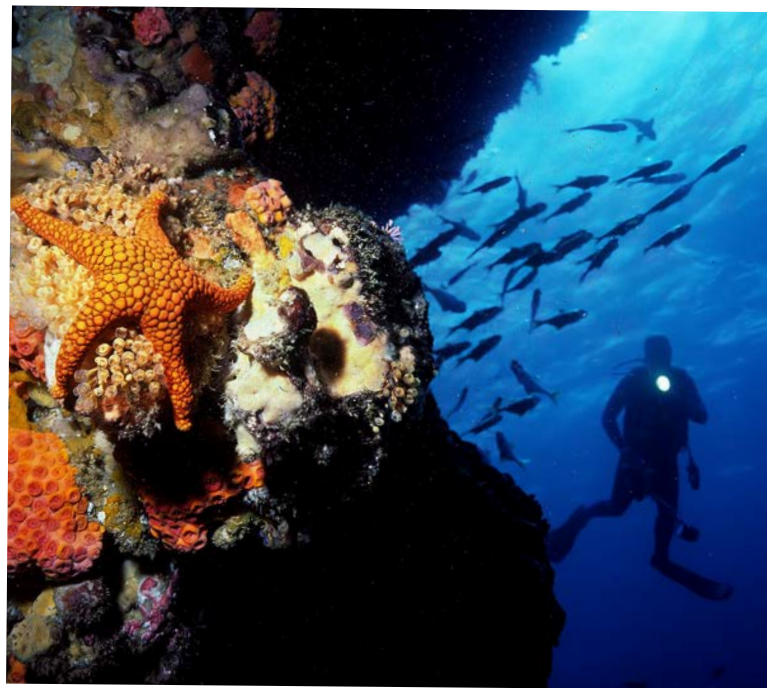
Above Diving.

Marine ecotourism activities, including dive charters and whale and dolphin watching, are increasingly popular and enable visitors to better appreciate and understand the region's natural values.