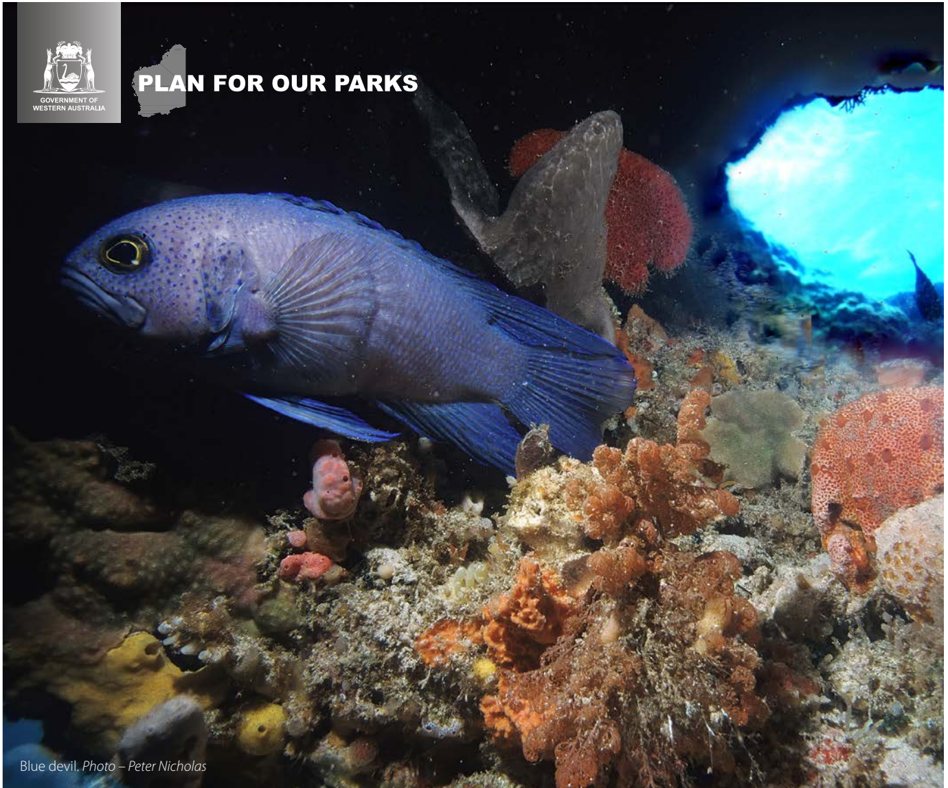
Blue devil.