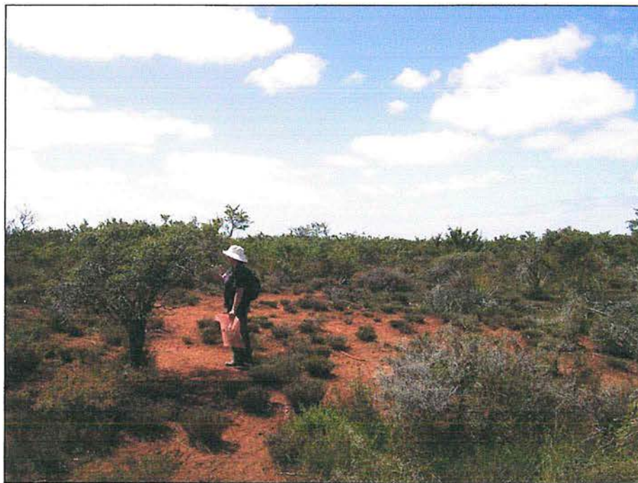
Figure 2. Scott River Ironstone occurrence

The distribution of this community is restricted to the Scott River Plain, which falls under the DEC Blackwood District. It consists of unique plant communities, which can be described as winter wet shrubland occurring on skeletal soils over ironstone ( Interim Recovery Plan 2011-2016 for Scott River Ironstone Association 2011). Dominant species are Melaleuca preissiana , Hakea tuberculata , Kunzea micrantha and Loxocarya magna . There are a number of DRF species present as well. Historically, ironstone soils may have been associated with bogs, the iron being deposited by water percolating through the soil and/or iron oxides precipitating on the surface with fluctuating groundwater levels. These soils undergo inundation of fresh water during the winter months as a result of rainfall ponding or rising groundwater levels. An example of an occurrence can be seen in Figure 2.