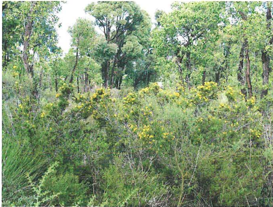
Figure 1. Swan Coastal Plain community type 20b occurrence

The first Interim Recovery Plan I worked on was concerned with Swan Coastal Plain community type 20b (SCP20b). This community is described as Eucalyptus marginata - Banksia attenuata woodlands with a shrub layer of Hakea stenocarpa , Conostylis setosa and Johnsonia aff pubescens ( Interim Recovery Plan 2011-2016 for Banksia attenuata and/or Eucalyptus marginata woodlands of the eastern side of the Swan Coastal Plain 2011 ). It is a species rich community with low weed frequency. 36 occurrences exist on the eastern side of the Swan Coastal Plain, occurring on sands at the base of the Scarp between Byford and Yarloop of the Pinjarra Plain and the Ridge Hill Shelf. An example of an occurrence can be seen in Figure 1. Main threats affecting this community are clearing, fire, weeds and recreational use. This community type was assessed as endangered in 1996. I was required to update and complete the IRP by researching for and adding information. Information was obtained through ArcGIS and the DEC TEC database as well as contacting various environmental officers.