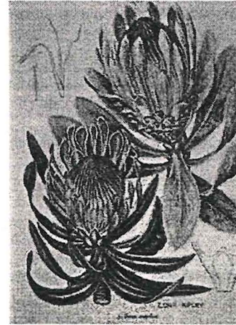
Illustrated book on The Proteas of Tropical Africa