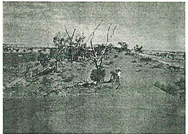
Crest of a red sand dune in the Great Sandy Desert