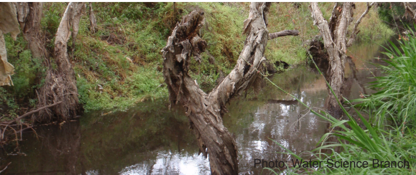
Weeds lining Blackadder Creek, August 2010.