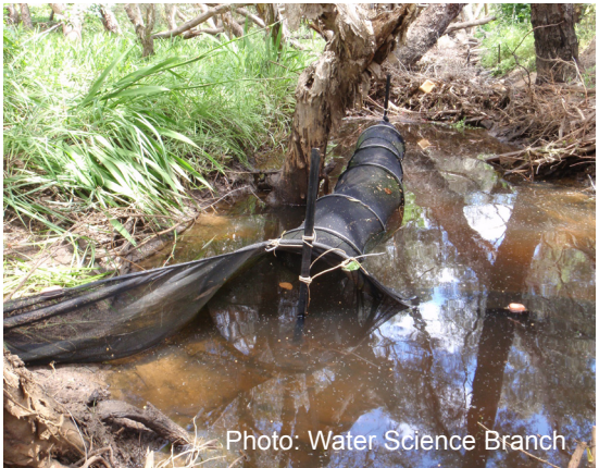
Weeds smothering vegetation along Blackadder Creek, October 2010 (left); A fyke net set in Blackadder Creek as part of a river health assessment, October 2010 (right).