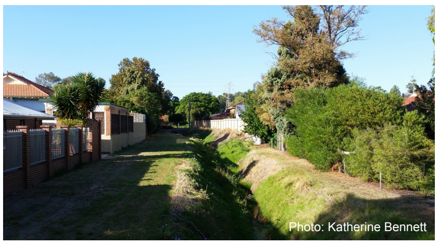
The SCCIS2 sampling site, August 2017.