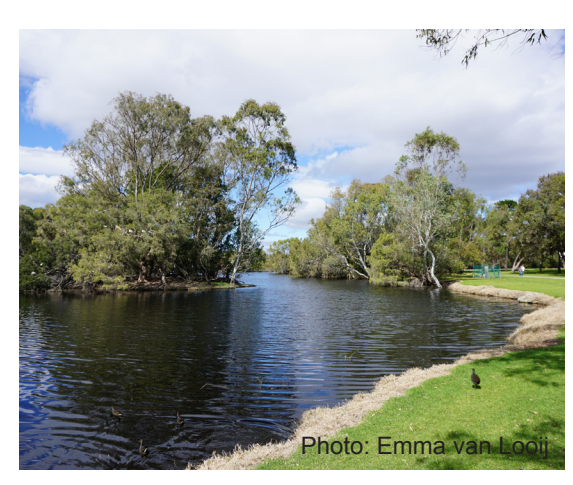
Tomato Lake, the grass along the lake has recently been sprayed, August 2017.