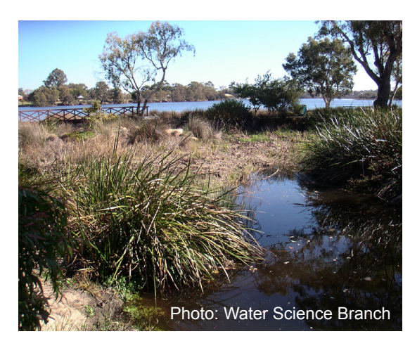
Adachi Park near the Swan River in the South Belmont Main Drain catchment, May 2006.