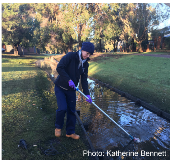
The sampling site near Galway Road (SCCIS1), August 2017.