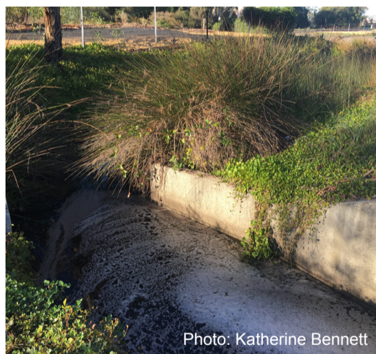
The sampling site on Wilson Main Drain (WIFRD), August 2017.