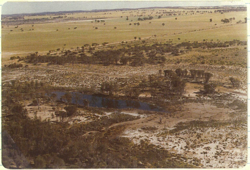
Arthur River Flats - between White Lake and St Helen - Perryin Rd. 25 Oct 78 Film 51 : 13