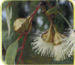
E. kingsmillii , Kingsmill's Mallee