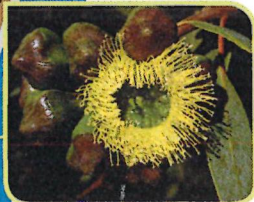
E. preissiana , Bell-fruited Mallee