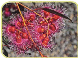
E. torquata , Coral Gum