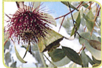
E. pyriformis , Pear-fruited Mallee