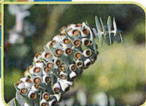
E. kruseana , Bookleaf Mallee