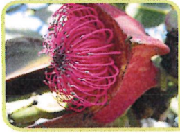
E. brandiana , Square-fruited Mallet