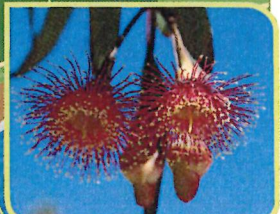
E. caesia , Silver Princess