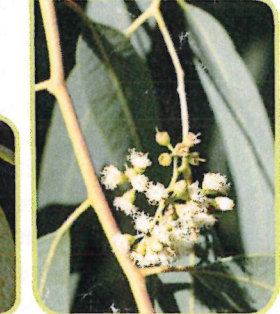
E. vitrix , Coolibah