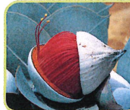
E. macrocarpa subsp. elachantha , Smallheaved Mottlech