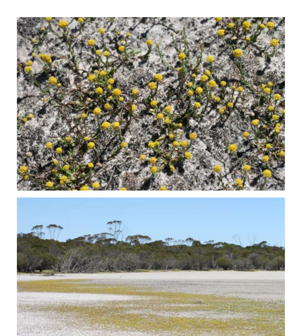
From top: Herb layer growing on the lake bed; Bentonite Lake; a stand of dead trees along drainage line; Bentonite Lake hydrological monitoring.

Trends to date suggest that surface flow and salinity is accumulating in the main Pinjarrega Nature Reserve drainage line, which is reflected in the highly degraded vegetation that occurs close to or on the drainage line which are largely dominated by Tecticornia (salt-adapted species) and dead stands of trees (see photo this article). This may affect occurrences of the TEC that occur in close proximity, which therefore highlights the importance of continual hydrological monitoring. Another trend indicated by the data is that evapotranspiration is greater than rainfall. This may decrease the chance of substantial recharge events which in