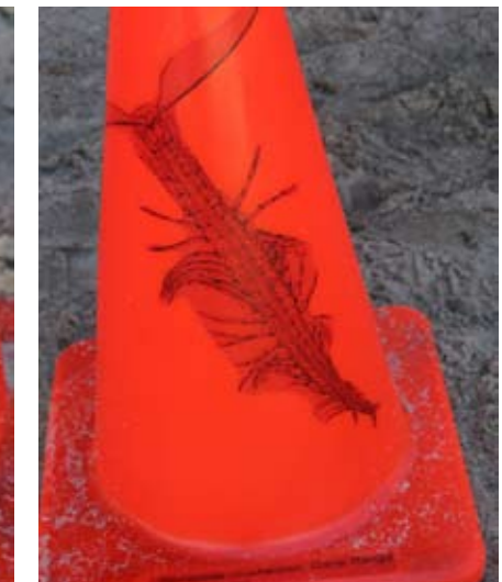
Above (Left): Butler's dunnart printed on a red plastic safety cone at the Sculptures by the Sea exhibition. ( Right ) Remipede crustacean printed on a red plastic safety cone at the Sculptures by the Sea exhibition.