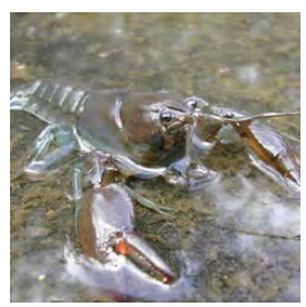
29 August 2013 Australian endangered species: Leckie's Crayfish