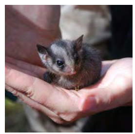
22 August 2013 Let's put threatened species on the election agenda