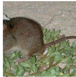
12 September 2013 Australian endangered species: Bramble Cay Melomys

The Western Australian Department of Fisheries leads the recovery team for the Hairy Marron which was established in 2005.