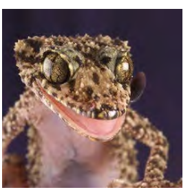
22 August 2013 Australian endangered species: Gulbaru Gecko