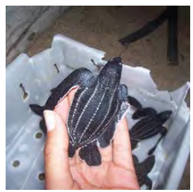
15 August 2013 Australian endangered species: Leatherback Turtle