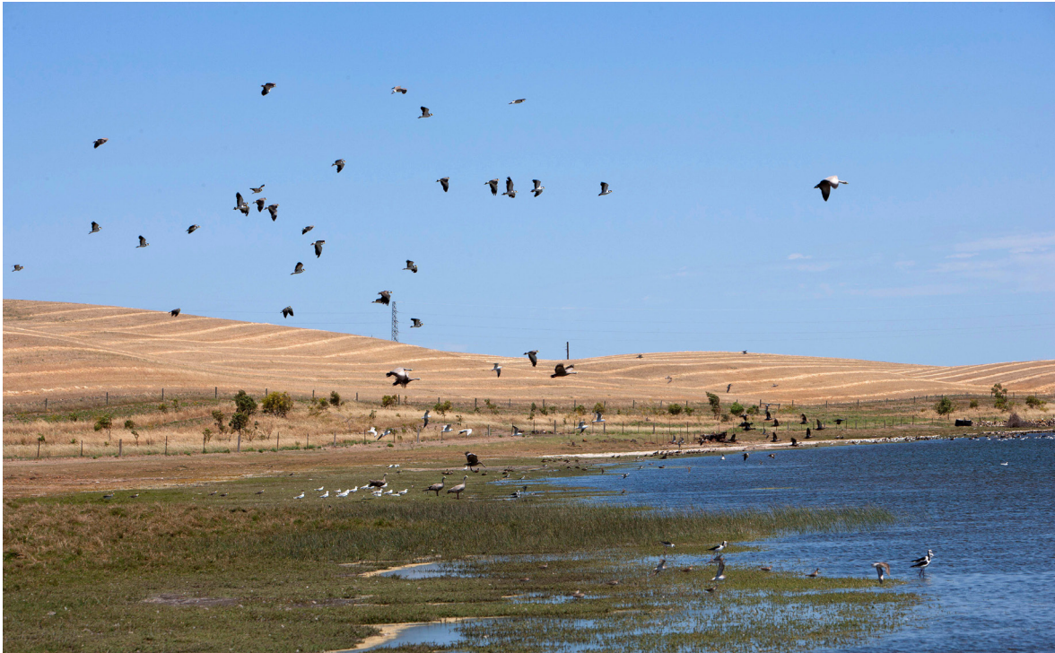
Photo: Birdlife of the Little Swamp Wetland in Port Lincoln (Dragi Markovic)

Another issue regarding important habitat is the degree of importance of habitat components within complexes or areas. For example, a large area may be considered internationally or nationally important, but within that area there may be particular habitats that are more valuable than others, such as those used most regularly for roosting and feeding. In promoting the wise use of wetlands, it may be pertinent to strongly protect such habitat from development and recreational activities that may disturb shorebirds, but consider allowing these activities within parts of the broader area.