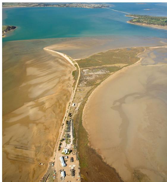
Photo: Aerial view of the Oyster Farms and coastal area of Barilla Bay (Nick Rains)

The Wildlife Conservation Plan for Migratory Shorebirds will remain in place until such time that the shorebird populations that visit Australia have improved to the point where they do not need research or management actions to support their survival. This plan will be in place for five years and will be reviewed in 2020. It is available for download from the Department's website at: www.environment.gov.au/resource/wildlife-conservation-plan-migratory-shorebirds