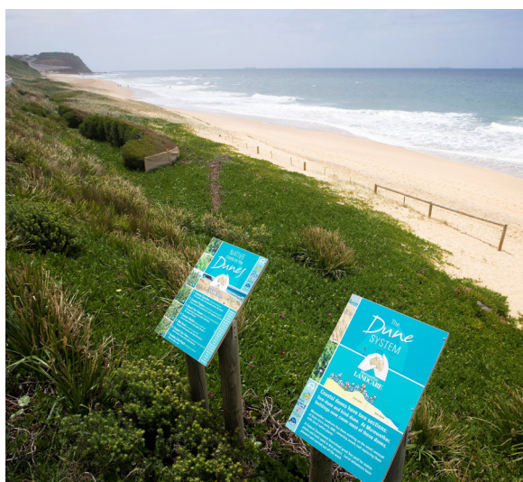
Long view northwards of the restored area of dunes behind Merewether Beach