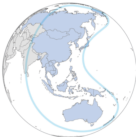
Figure 1. East Asian—Australasian Flyway

Thirty-seven species of migratory shorebird regularly and predictably visit Australia during their non-breeding season, from the Austral spring to autumn. Australia's coastal and freshwater wetlands are important habitat during the non-breeding season as places for these migratory shorebirds to rest and feed, accumulating energy reserves to travel the long distance (up to 13 000 kilometres) back to their breeding grounds. In the month or two before migrating, migratory shorebirds need to increase their body mass by up to 70 per cent to sustain their journey.