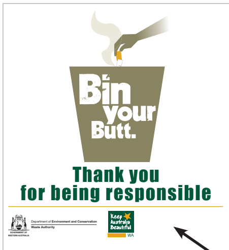
Your logo here

A range of additional resources are available from the KABWA website to assist in promoting the anti-litter message to the community. These include car litter bags, bumper stickers, reusable shopping bags and signage templates.