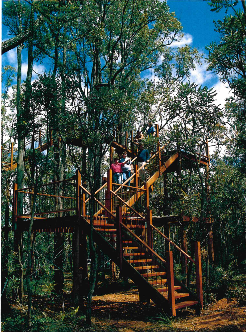
A series of platforms and stairways give access to the treetop canopy and to a viewing deck inside the School of Wood.