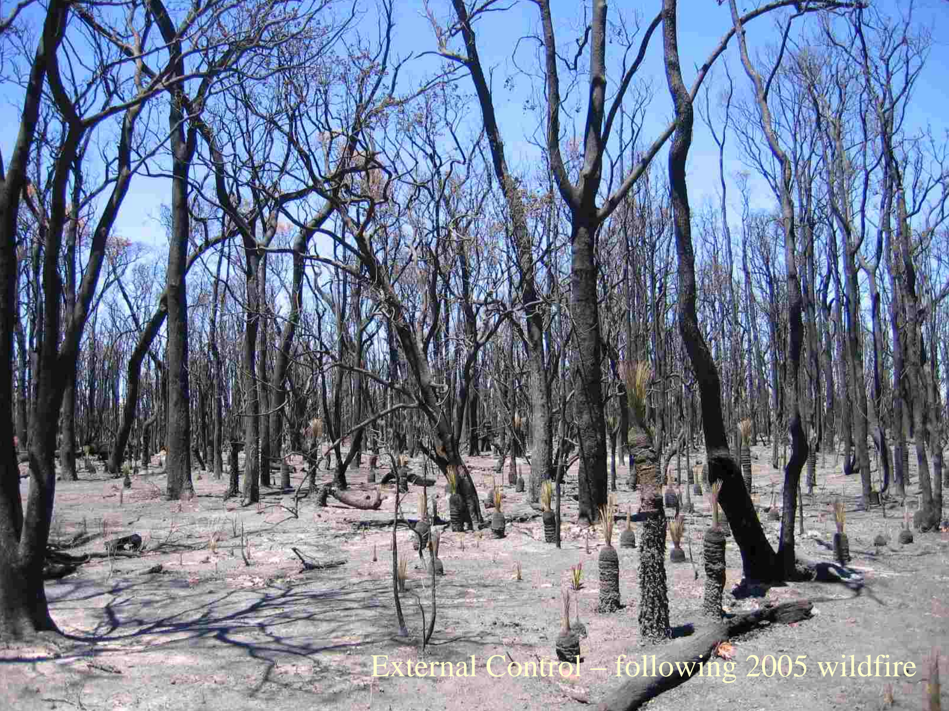
External Control – following 2005 wildfire