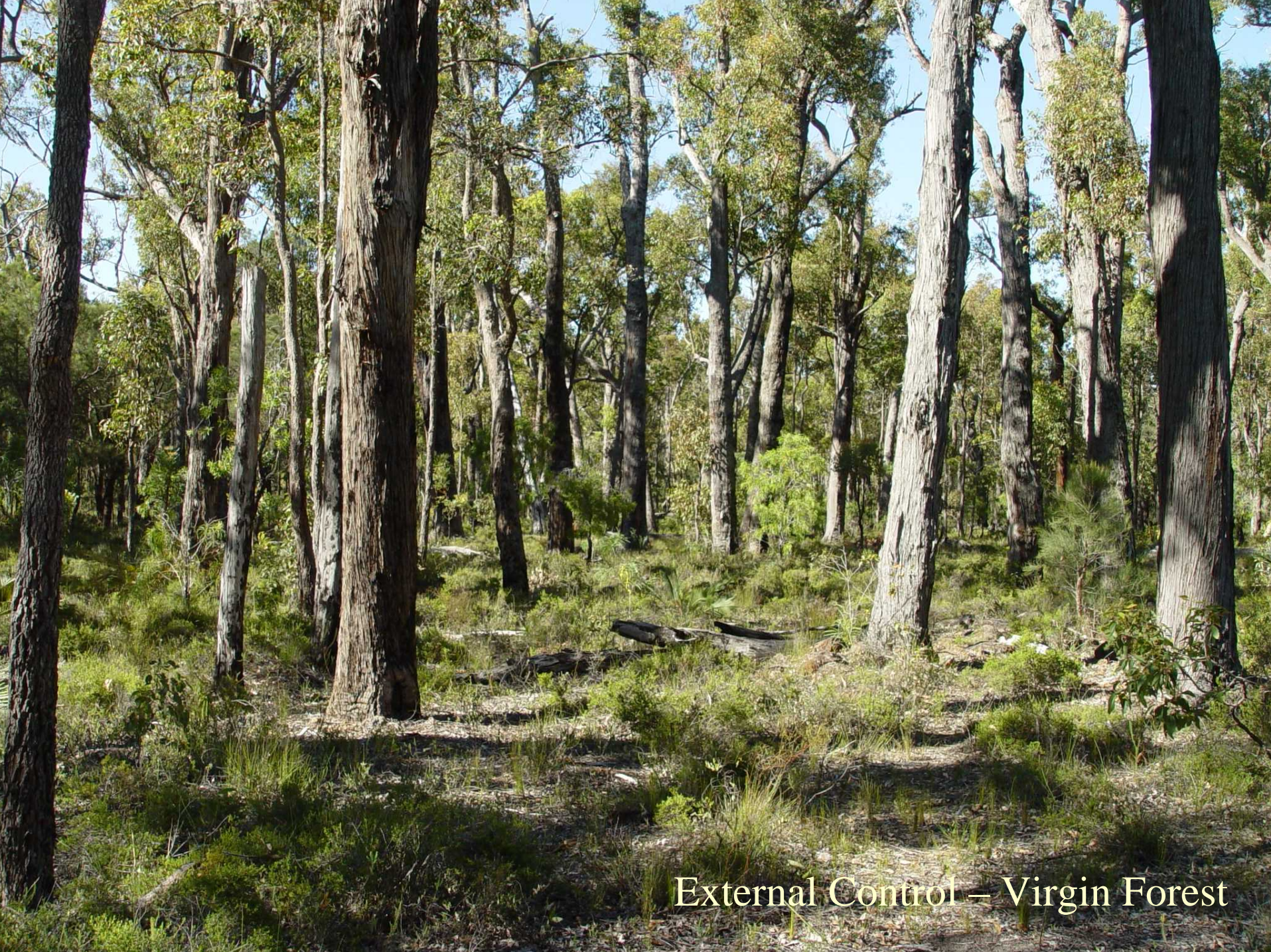
External Control – Virgin Forest