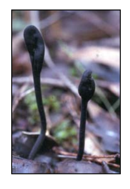
EARTH TONGUES Firm and fleshy with a tonguelike appearance