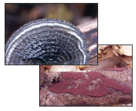
FLASK FUNGI Usually hard and carbon-like