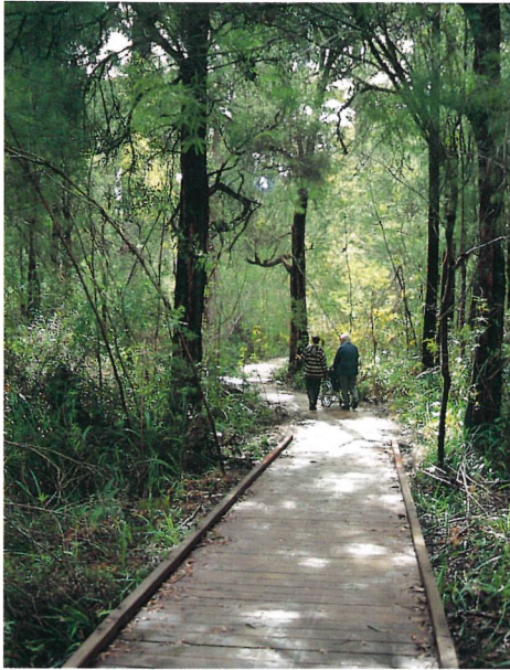
The Ancient Empire and the Tree Top Walk are both accessible to people in wheelchairs.