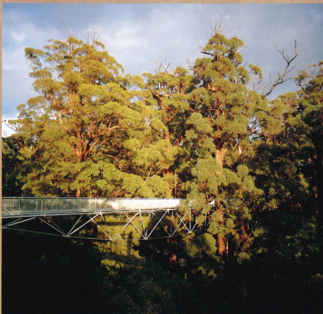
The Tree Top Walk, through the crowns of giant tingles.