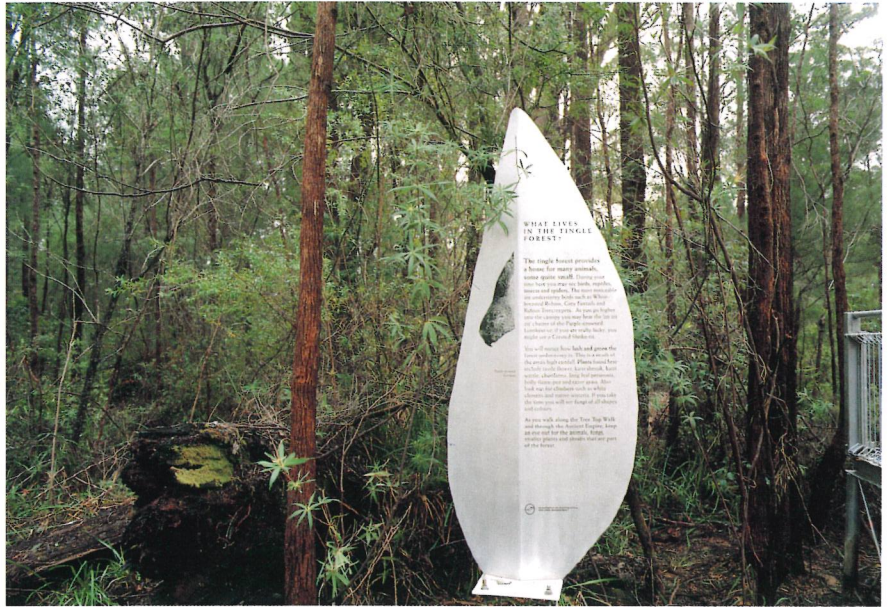
This interpretive panel, which stands near the start of the Tree Top Walk, is one of many examples of the leaf-shaped motif used extensively throughout the Valley of the Giants.