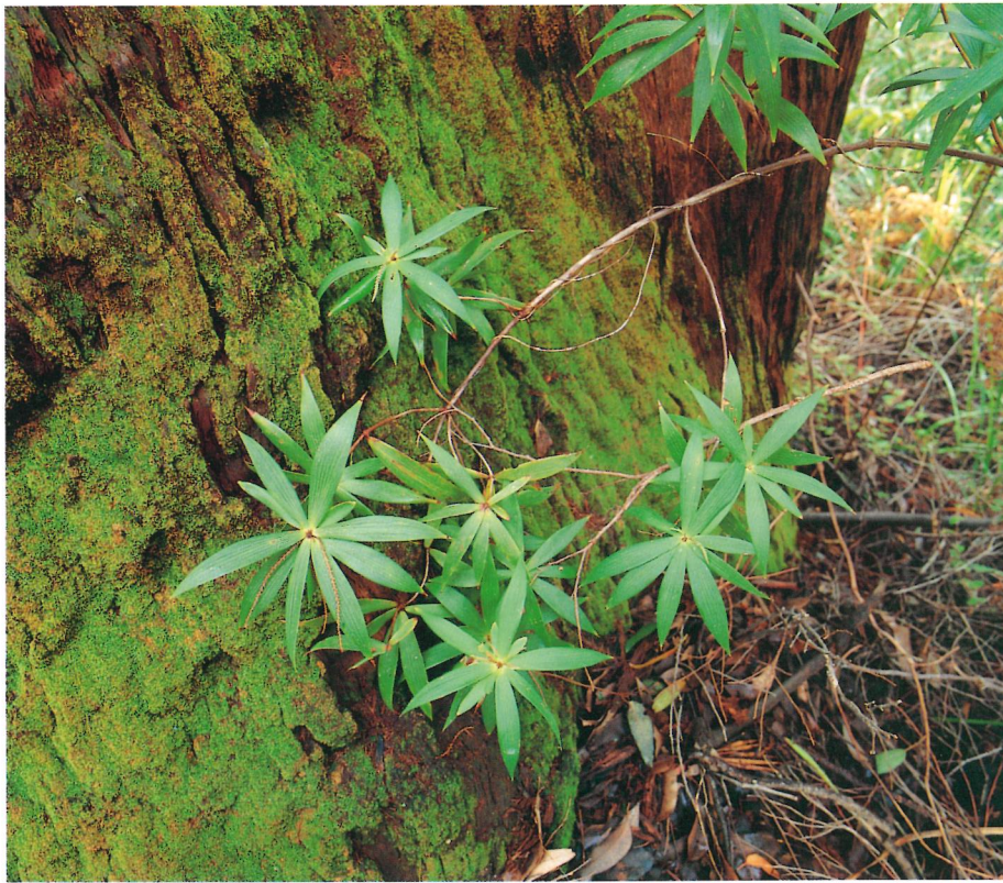
Natural art. The designers were influenced by the shapes and colours of the tingle forest. The form of the Tree Top Walk is strongly influenced by the tassel flower, while the pylon colour mimics tingle bark.

hoisted into position, minimising site disturbance and creating a walkway that, remarkably, only occupies about three square metres of forest floor.