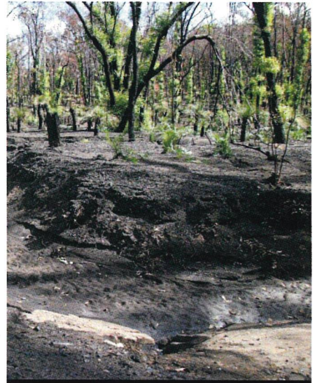
Right Regrowth appearing in the months following the 2005 fire.