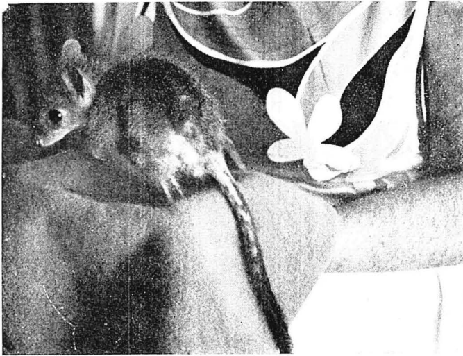
Bald areas around the tail of this Rat Kangaroo are treated with Baby Oil.