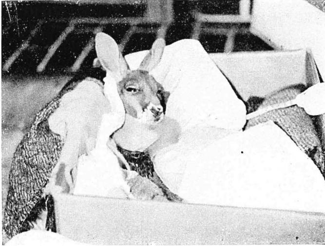
A cardboard box, rugs and an electric blanket keep this young "Red" warm.

The presence of teeth does not mean that solids are required, but as soon as the joey starts to explore and show interest in its surroundings, it should be given the opportunity to eat adult fare. It is a good idea to include in its bedding dry or green grass—this gives the joey the opportunity to nibble if it feels inclined. Joeys can be fed on the following solids : green grass, rose pedals and leaves, fruit tree leaves, loquat leaves, maiden hair fern, dates, seeded raisins, apples, carrots, bananas, cereals, macaroni or bread. Make sure that the leaves and grass have not been sprayed with poison. Grass should be included as much as possible.