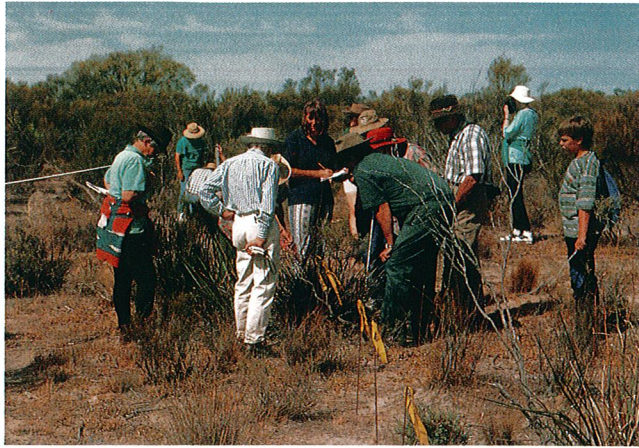
Learn about your bushland.

Land for Wildlife can offer you contact with like-minded landholders, and a chance to share in their ideas and experiences through publications, field days and other activities. Additional information is available in the form of regular newsletters and more detailed publications. Land for Wildlife fits in very well with various landcare activities. No matter what activity is considered, whether it be protecting a wetland, creek line, breakaway or granite outcrop, creating a shelter belt, rehabilitating salt land or even alley farming, a little bit of thought at the planning stage can create an area that wildlife can also use, giving multiple benefits to the property and the wildlife.