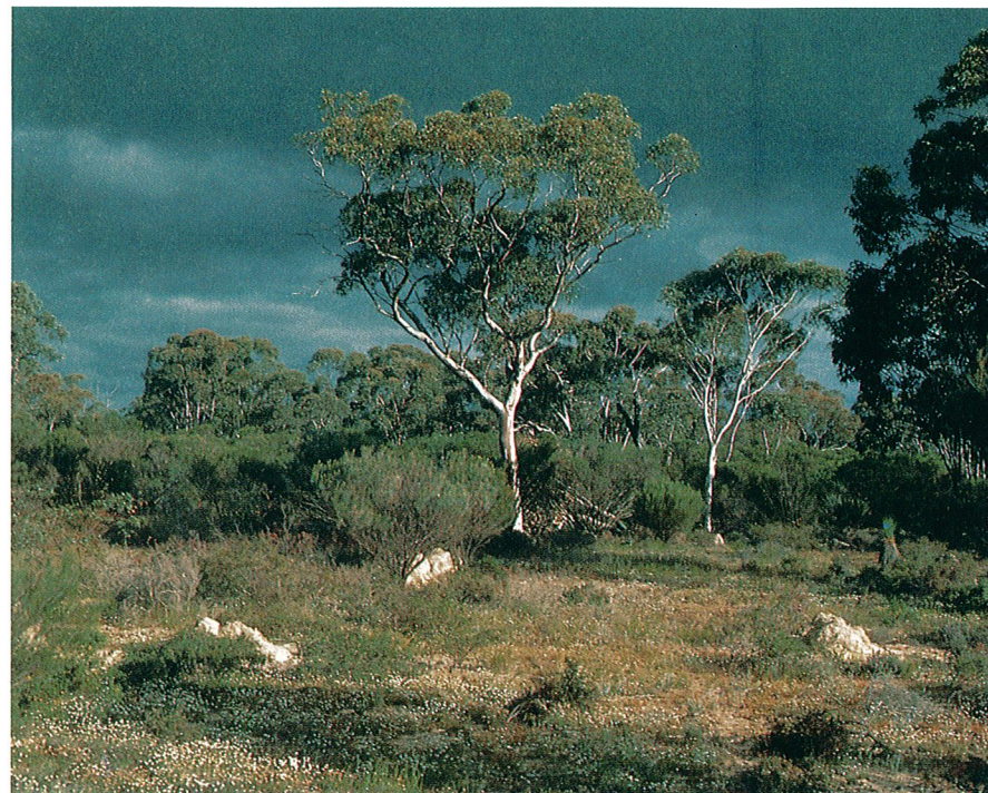
Top quality bushland, managed for production of white gum strainer posts and for nature conservation.

Participation in the scheme is entirely voluntary. Registration with Land for Wildlife will not change the legal status of the property in any way.