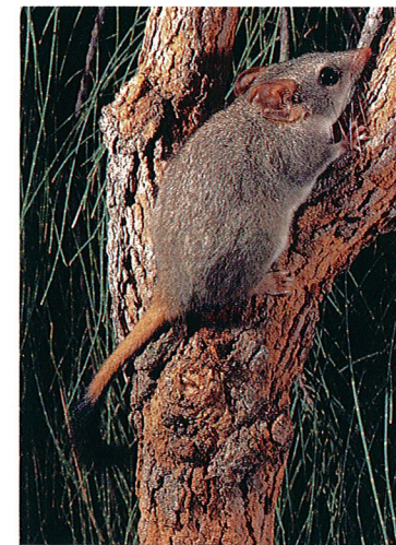
Encourage local wildlife.