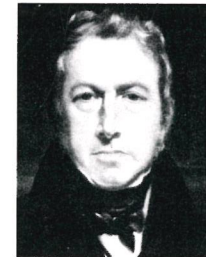
Botanist Robert Brown

Albany, Western Australia 9 – 11 December 2001