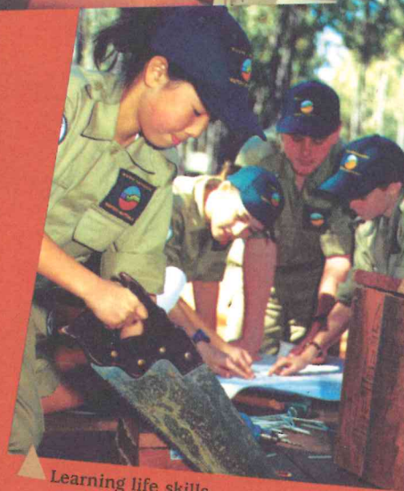
Learning life skills