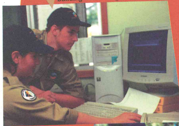
Building a knowledge base

Yes. CALM Bush Ranger Units welcome parents and community members interested in leading, instructing or supporting the program.