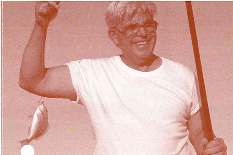
Marine Conservation Reserves cater for a wide range of recreational activities

The marine environment of this State is owned by all Western Australians. Unlike the land, where usage rights are defined by titles and boundaries, the sea is not private property, but is a common asset available to all users. While the freedom of open access is cherished by most Western Australians, experience elsewhere clearly demonstrates that increasing levels of human use lead to conflict among users, and eventually to environmental degradation.