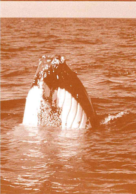
Main cover photos: Coral reef Inset: Male fiddler crab Left: Humpback whale

Two areas of the Pilbara coast have been identified for further consideration as marine conservation reserves during the next 2 to 3 years. These are illustrated in the accompanying map.