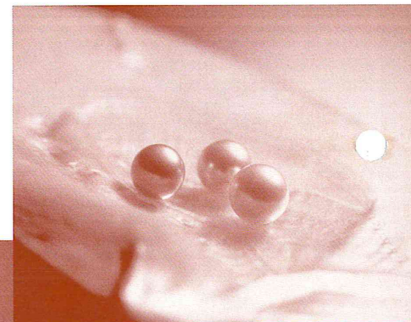
Pearling and other commercial activities are catered for in Marine Conservation Reserves