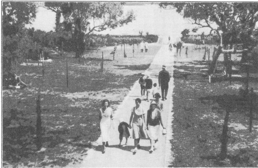
A 1940s view - paths such as this one from McNess House to the lake will be reinstated.

Most of the original development at Yanchep was completed during the 1930s. Much work is now needed to ensure the park continues to meet the needs of visitors and to ensure the park's heritage values are not reduced.