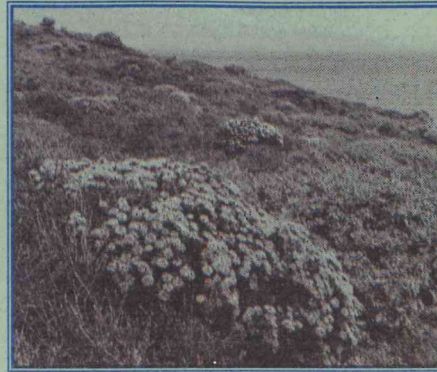
Ground-hugging bushes of Pimelea ferruginea

cumbed to the drought. Come back in a few weeks however, after the first autumn rains, and they have sprung back into life, vigorous and green.