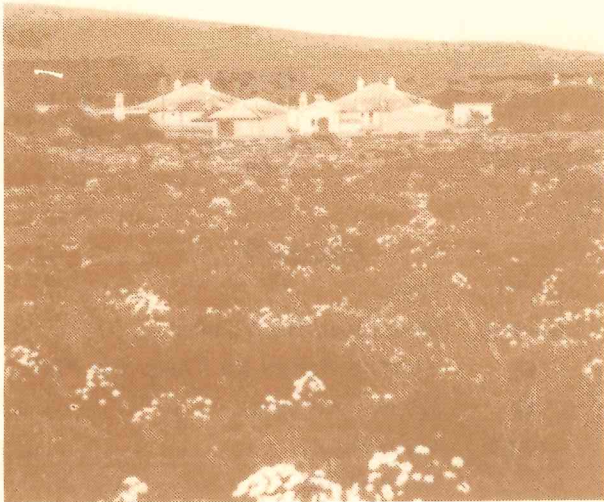
Looking north from near West Coast Track. The Cape Naturaliste Lighthouse complex with flowering pimelea and various heaths in the foreground.