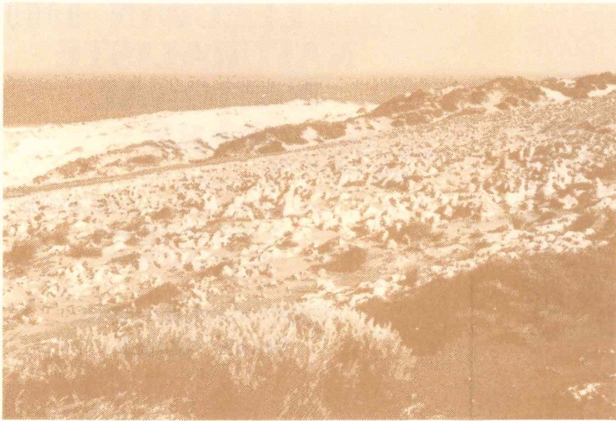
A section of exposed capstone through which the trail passes on Cape Naturaliste.

THE CAPE NATURALISTE WALK TRAILS have been provided for the enjoyment of park visitors who wish to undertake short walks and enjoy fine scenery in the Cape Naturaliste area.