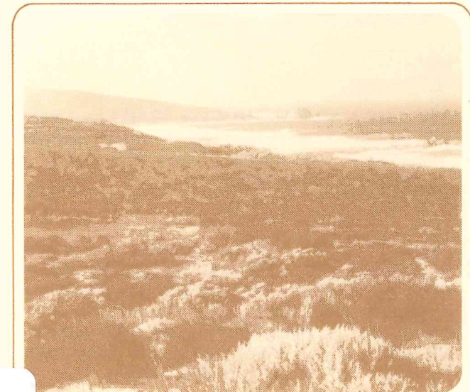
FROM THE TRAIL SOUTHWARDS TO SUGARLOAF ROCK.