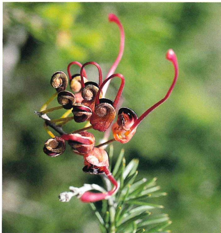
The red flowers appear from September to October.

If unable to contact the district office on the above number, please phone the Department's Wildlife Branch on (08) 9334 0422.