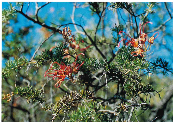
Mt Lesueur grevillea in full flower.