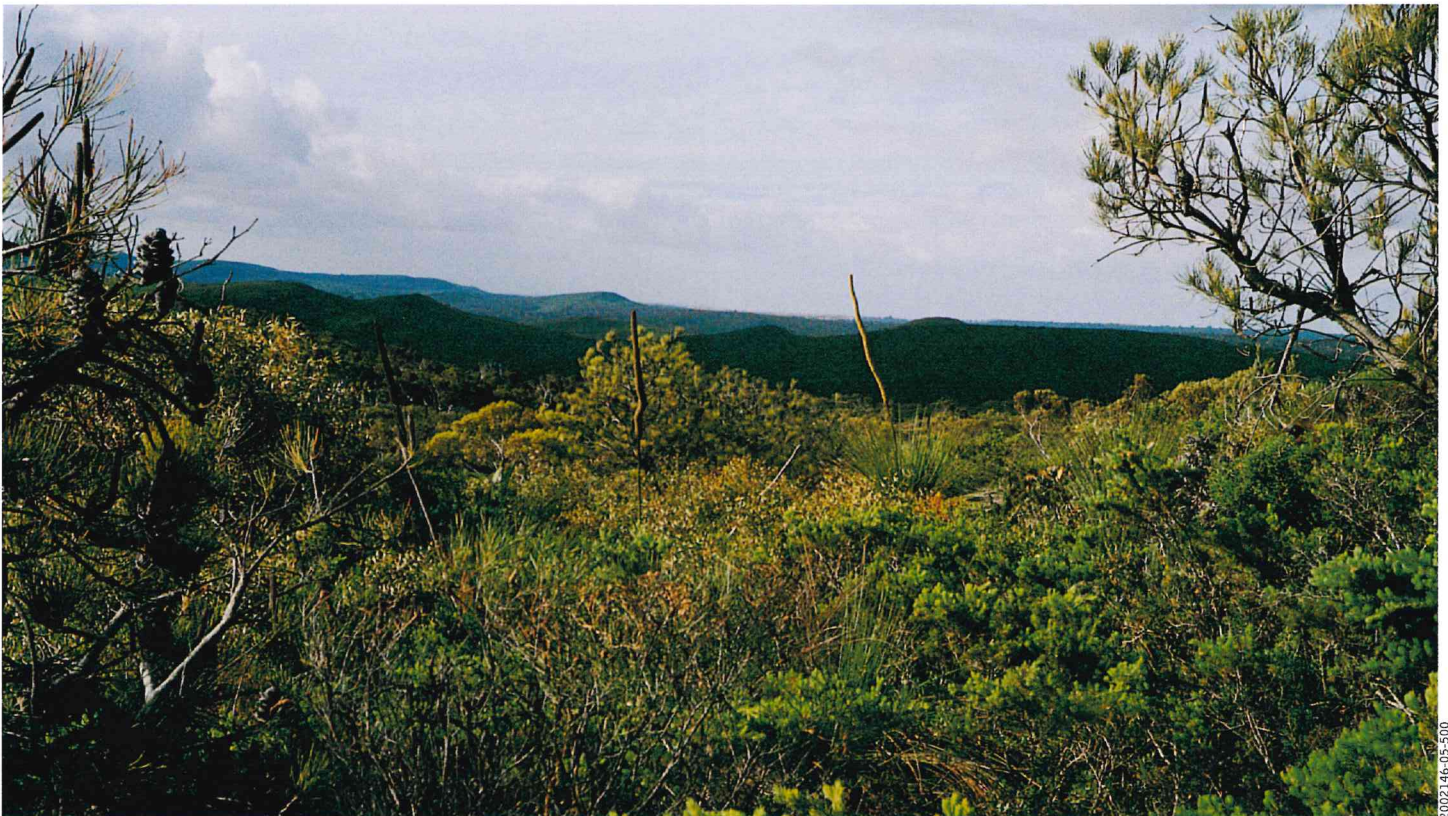
The habitat in Mt Lesueur National Park is under threat from dieback disease.