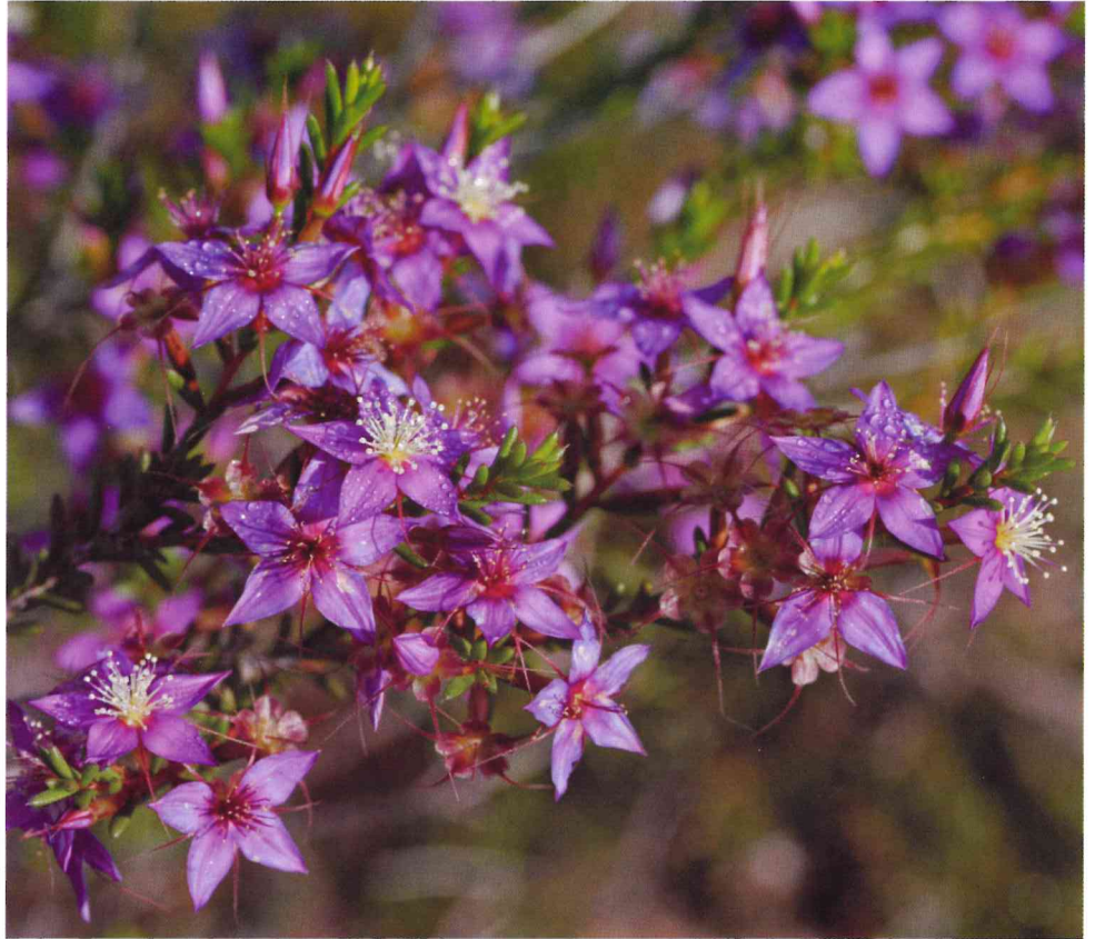
Closeup of flowers illustrating the numerous stamens and whisker-like projections typical of the genus Calytrix .

Swamp starflower was ranked as Critically Endangered in 1995 and DEC, through the direction of the Swan Region Threatened Flora and Communities Recovery Team, has been addressing the most threatening factors affecting its survival in the wild. There are currently only two populations of swamp starflower recorded and they both occur in the Kenwick area. These populations are threatened by weed invasion, firebreak maintenance activities, grazing by rabbits, trampling by horses, changes in hydrology and inappropriate fire regimes.