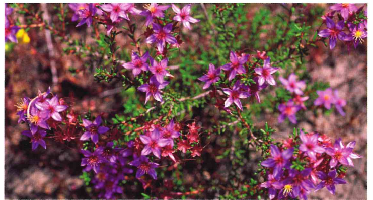
Swamp starflower in full flower.