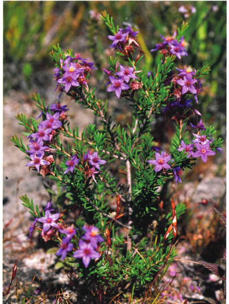
A two-year-old seedling flowering for the first time.

Protection from future threats – Other recovery actions include the development of a fire management plan to protect the subspecies from inappropriate fire regimes; the maintenance of dieback hygiene; regular monitoring of the health of each population; ensuring that relevant authorities, land owners and DEC personnel are aware of the subspecies' presence and the need to protect it and are all familiar with the threatening processes identified in the Interim Recovery Plan.