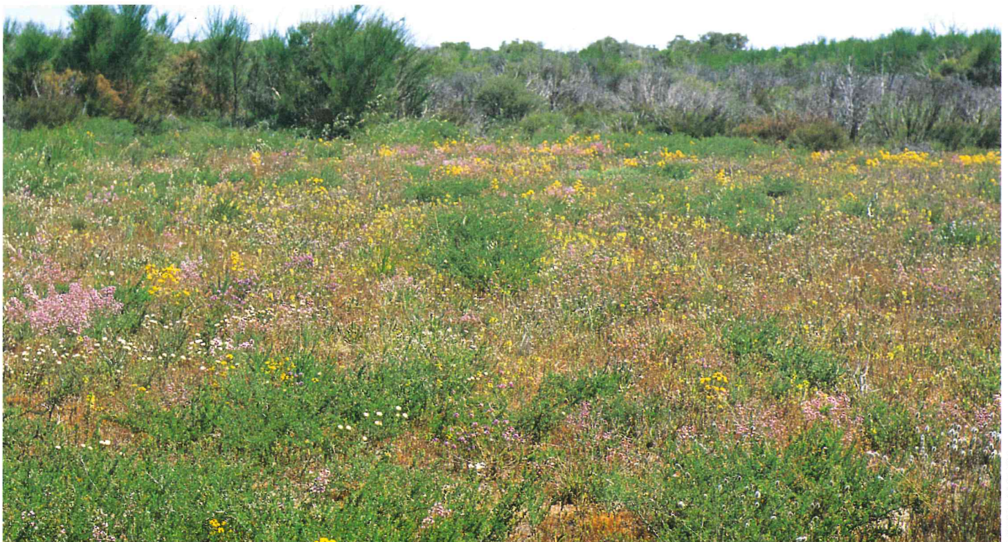
Swamp starflower is found in winter-wet areas that begin to dry out as the species begins flowering.

This project is funded by the Australian and State Governments' investment through the Natural Heritage Trust administered in the Swan Region by the Swan Catchment Council.