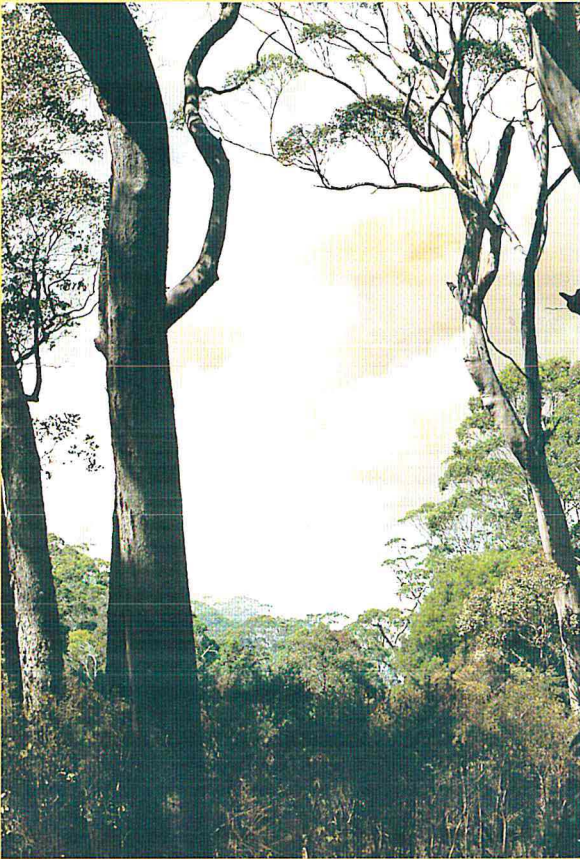
Smoke from CALM planned burning is diverted away from population centres by accurate weather forecasting and burn scheduling.

CALM crews, sometimes with the assistance of local volunteer fire brigades, constantly monitor progress while the burn is under way and then mop up and patrol the edges to ensure the fire is safe.