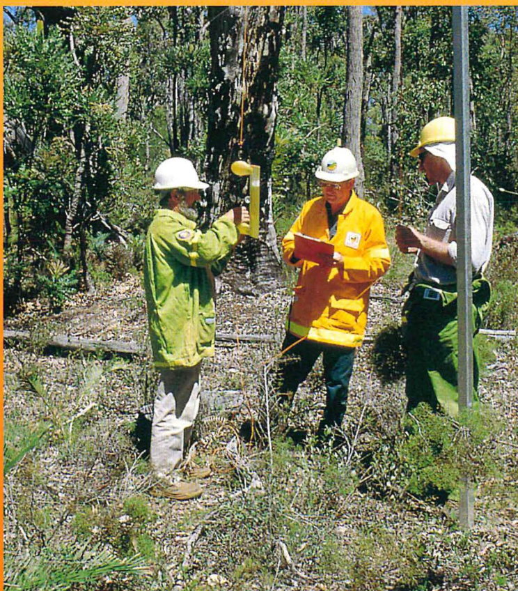
Burn Managers measure forest fuel weights that are used to calculate fire spread and intensity for planned burns.

Even though burns might be scheduled for a particular season, the actual number carried out depends on prevailing weather conditions and available resources. Often, burns scheduled for a particular year are postponed for a later time when conditions are more favourable.