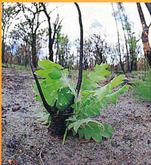
A bull banksia resprouting after fire.

Fuel reduction burns lit under mild weather conditions are low intensity, slow moving fires that creep across the forest floor consuming the leaves, twigs and bark. Not all the fuel is burned. These types of planned fires are designed to leave a mosaic of burned and unburned pockets to create a patchwork effect. Once forest fuels are reduced, a crown fire will not develop—even under extreme weather conditions.