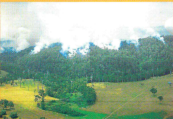
Planned burning is designed to create mosaics of burnt and unburnt patches that provides protection to farms and forests.

However, one fact that cannot be denied is that fire was, is and will remain an integral part of our natural Australian environment. Perceptions by Australians continue to evolve .