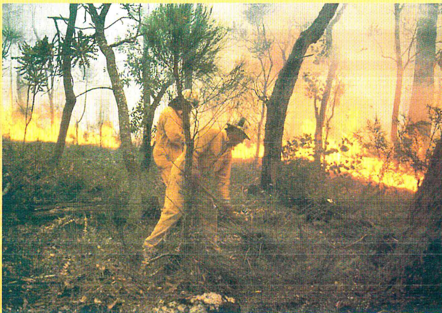
Each year CALM firefighters battle hundreds of wildfires throughout the south-west forests.

Aboriginal people have used fire for more than 40,000 years for heating, cooking and for clearing the country to enable easier access for hunting, as well as to stimulate regrowth of native grasses to attract native grazing animals. Aborigines also used fire to create buffers to help protect them against the ravages of wildfires.