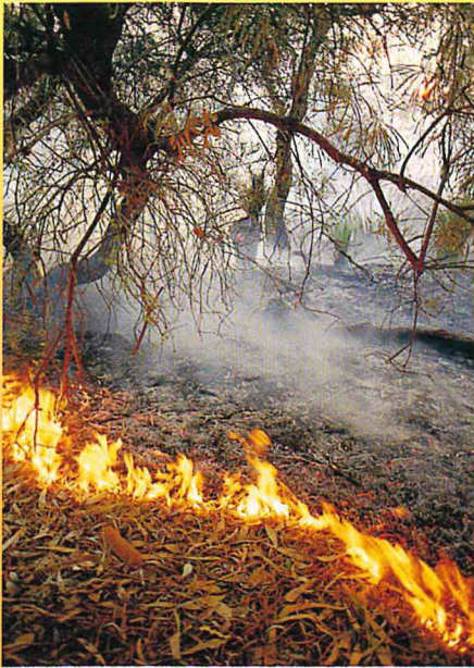
Low intensity planned burns consume ground fuels and reduce the severity of summer wildfires.