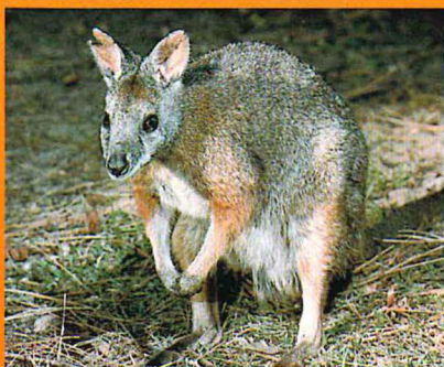
Tammar wallabies require fire-induced thickets in streamlines for refuge during reproduction and for protection from predators.

Fires are also used to protect or regenerate animal habitats and to promote the growth of vegetation on which native animals feed, such as the thickets growing alongside streams where tammar wallabies and quokkas live. These thickets need periodic fire—about every 15 to 25 years—to regenerate. Therefore, strategic fuel-reduced buffers are needed in adjacent areas to protect their habitat from the ravages of wildfires.