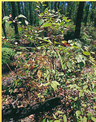
Young jarrah regrowth emerges through gaps in the forest canopy following carefully prescribed silvicultural burning.