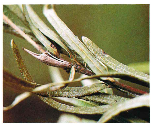
Fruit of Green Honeysuckle.

The species reproduces well from seed although its solitary fruits each contain only one or two seeds. In 1980, mortalities were observed among seedlings which had germinated in relatively dry exposed areas. The Donnybrook Sunkland contains infestations of dieback caused by Phytophthora cinnamomi , a disease that tends to spread rapidly along water courses. In 1980 there was no evidence that mature plants of the Green Honeysuckle were suffering any setback from this disease although it seemed probable that at least some populations would have come into contact with dieback.