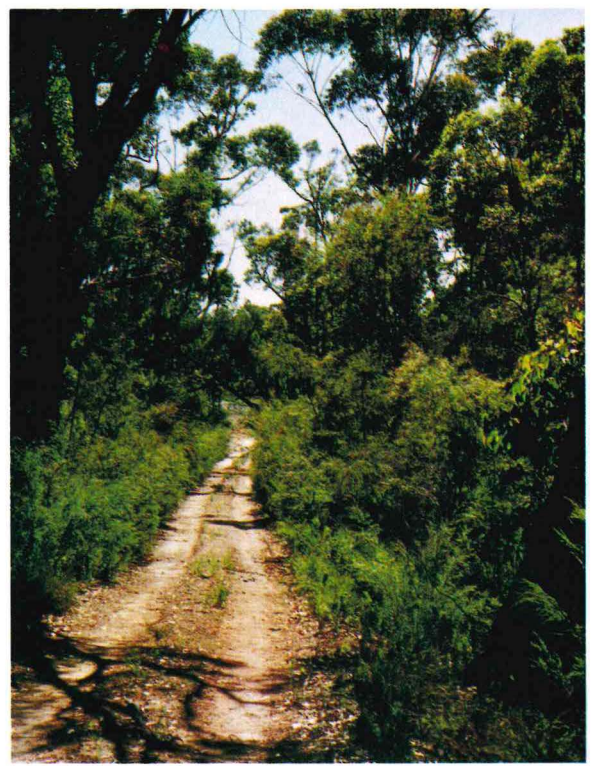
Green Honeysuckle's natural habitat in a Jarrah and Bullich forest bordering a creek in the Whicher Range south of Busselton.

The species is restricted to the Donnybrook Sunkland — Whicher Range area, south of Busselton and has a geographical range of 30 km. The average annual rainfall is about 1100 mm. L. rariflora grows in heavy clay soil on ephemeral creek banks or in low swampy ground. It is associated with forests or woodlands of Jarrah ( Eucalyptus marginata ), and forms a dense understorey generally mixed with Agonis linearifolia and a Hakea species.