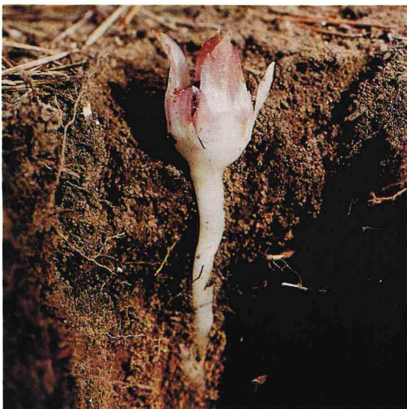
A partially excavated Underground Orchid.

Flowering occurs in May and June and the plants may flower at least two years in succession. The mature flower heads never appear above ground level, their highest portions being a few millimetres below the soil surface. However, they do raise and crack the topsoil,