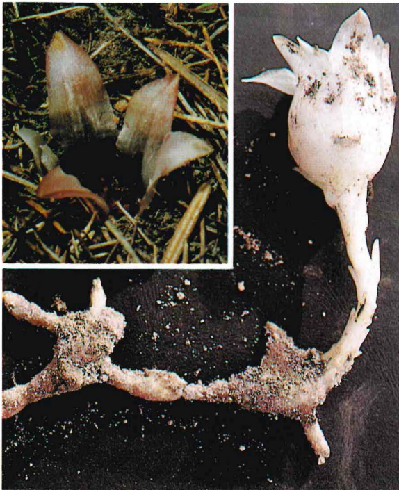
Side view of an excavated Underground Orchid. Inset shows a plant slightly emergent from the soil.

Rhizanthella gardneri Rogers (ORCHIDACEAE)