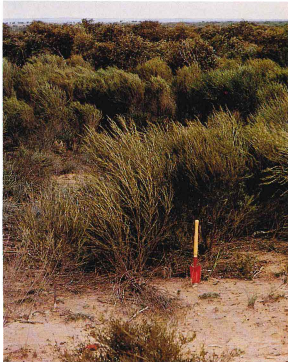
The Underground Orchid's habitat near Munglinup with small Broom Honeymyrtle shrubs.

Insect vectors are required for the flowers to be pollinated. There have been two observations of insects visiting the flowers and bearing the orchid's pollen. One of these insects was captured and identified as a species of wasp while the other insect was a fly. The seeds apparently mature in November-December but seed set appears to be low. The fruits are succulent.