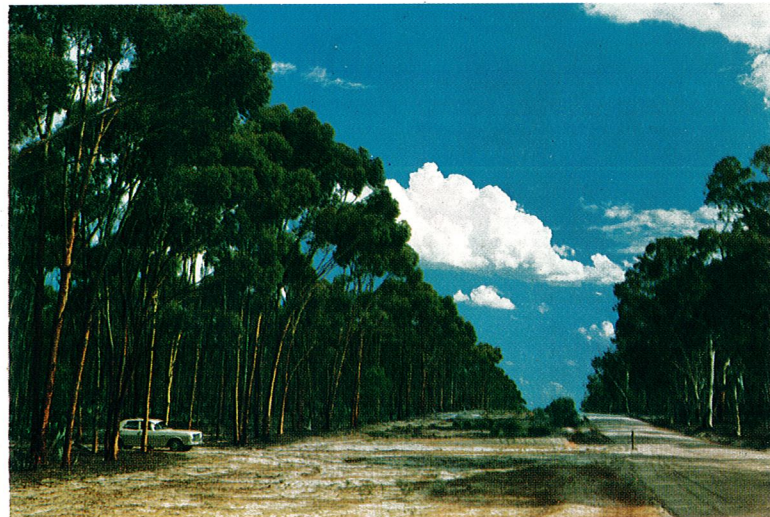
▲ Plantation of brown mallet ( Eucalyptus astringens )