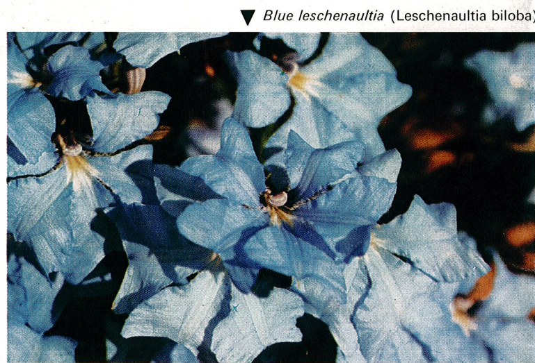
▼ Blue leschenaultia ( Leschenaultia biloba )