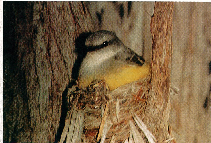
▼ Yellow robin ( Eopsaltria griseogularis )