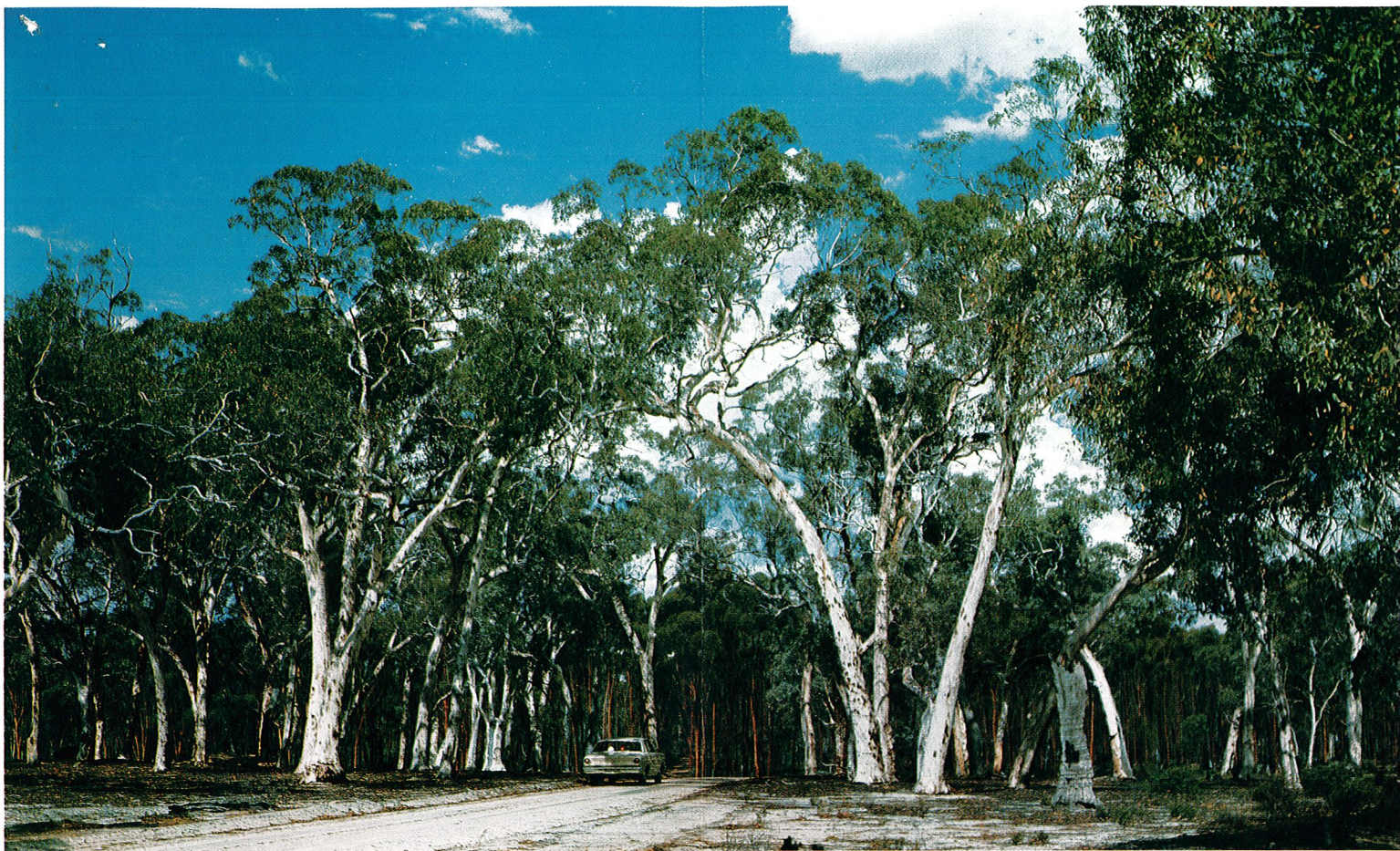
▲ Powder-bark wandoo ( Eucalyptus accedens )