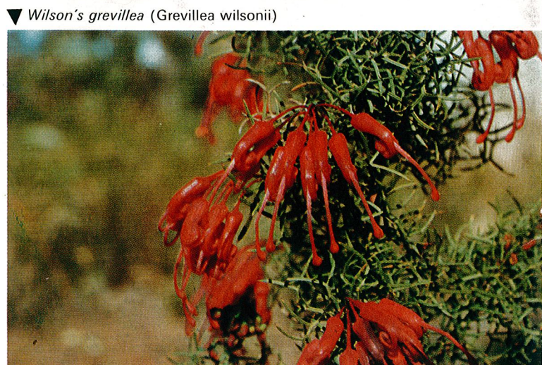
▼ Wilson's grevillea ( Grevillea wilsonii )