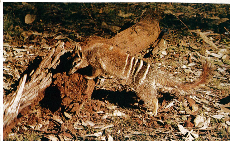
▲ Numbat ( Myrmecobius fasciatus )