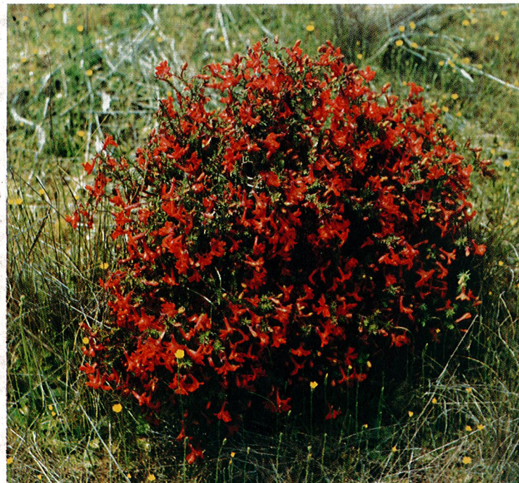
▼ Red leschenaultia ( Leschenaultia formosa )