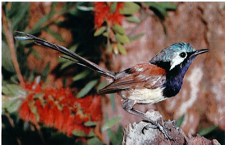
▲ Red-winged wren ( Malurus elegans )