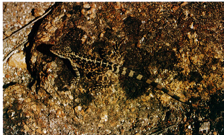
▼ Ornate dragon, or running lizard ( Amphibolurus ornatus )