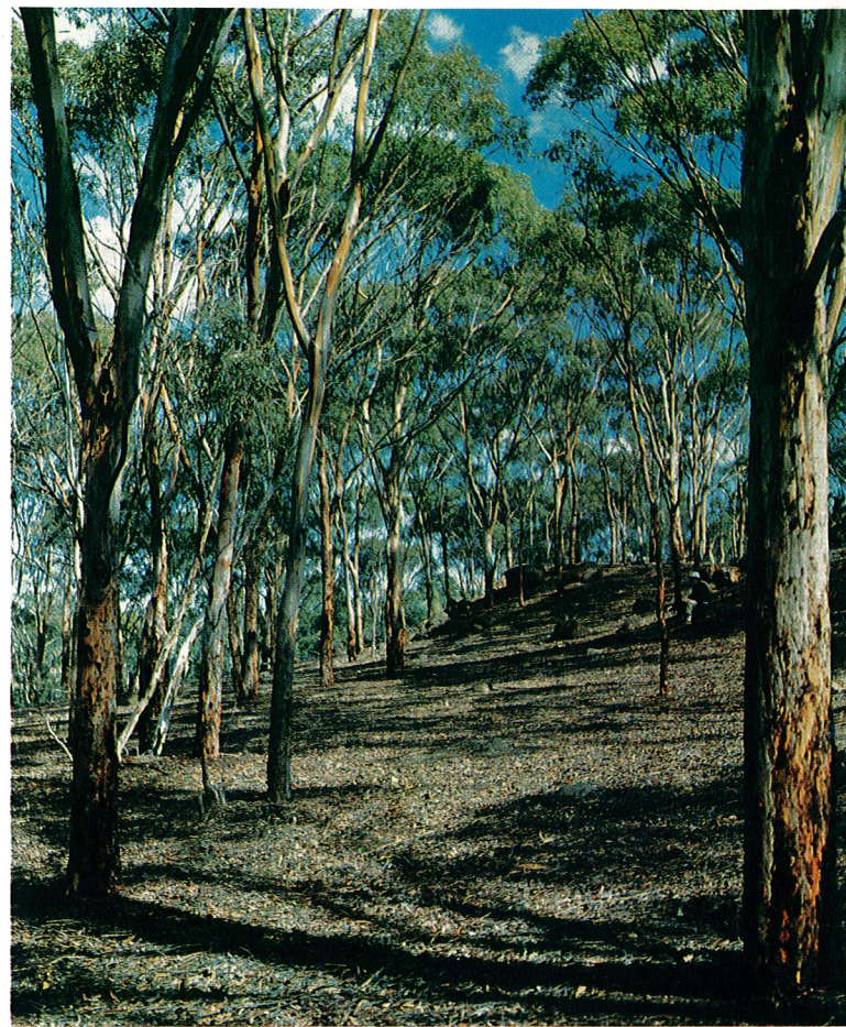
▲ Natural brown mallet ( Eucalyptus astringens )