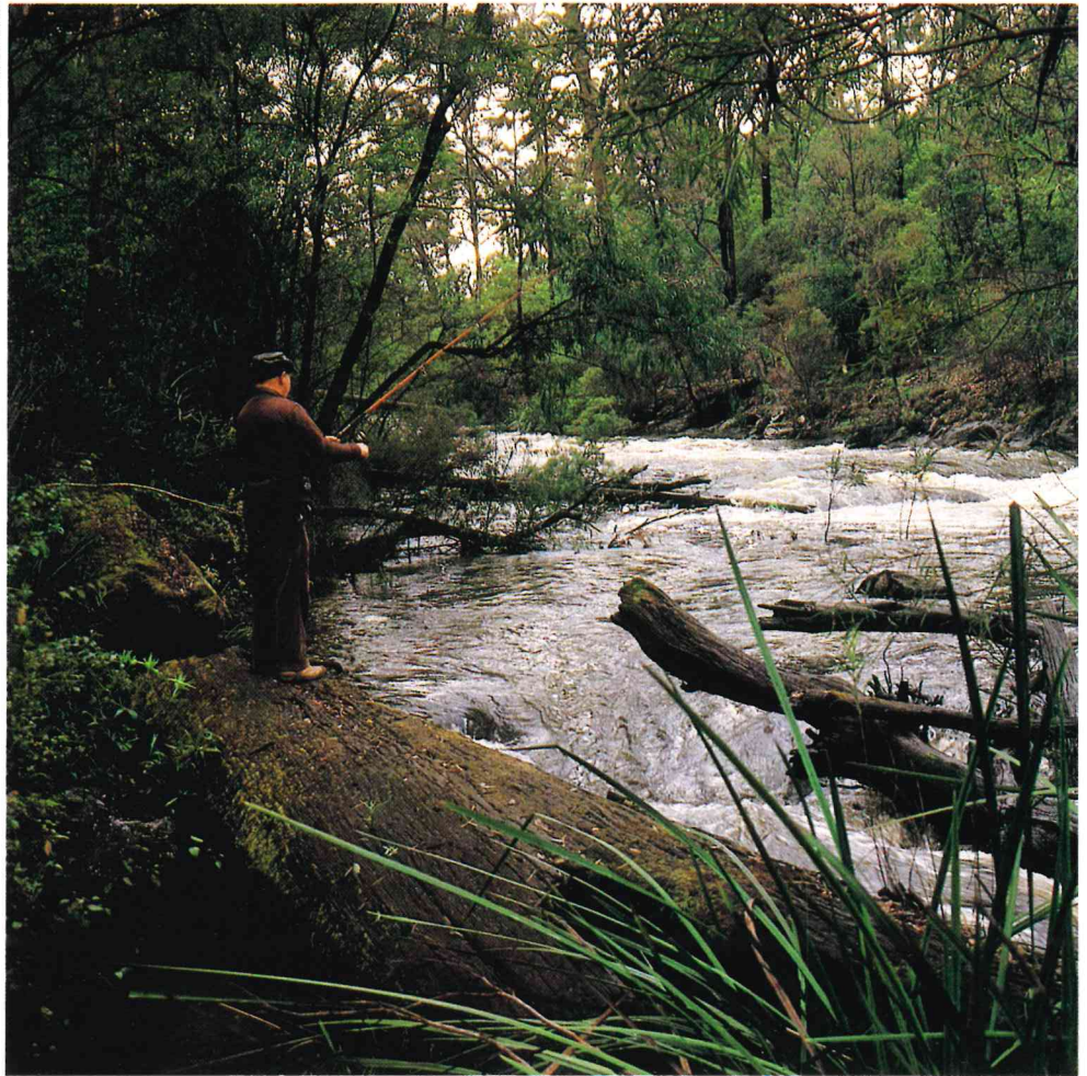
Trout fishing in Lefroy Brook